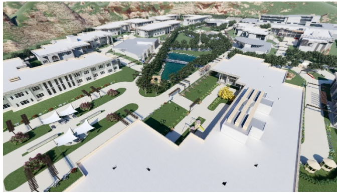
A-Perspective of the proposed project