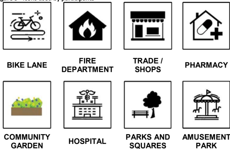
Figure 3 - Icons used by participants