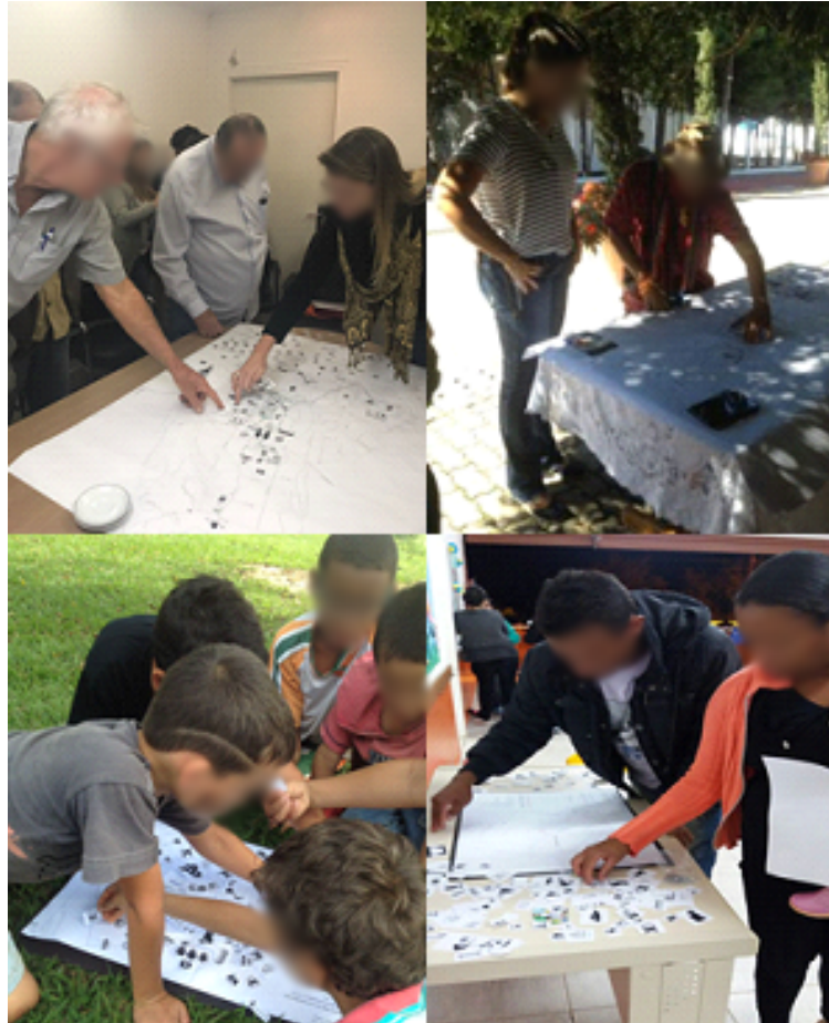
Figure 2 – Participants inserting icons on the map

to participate of the research. So, there is a wishes overlap without contact between participants during the map construction.