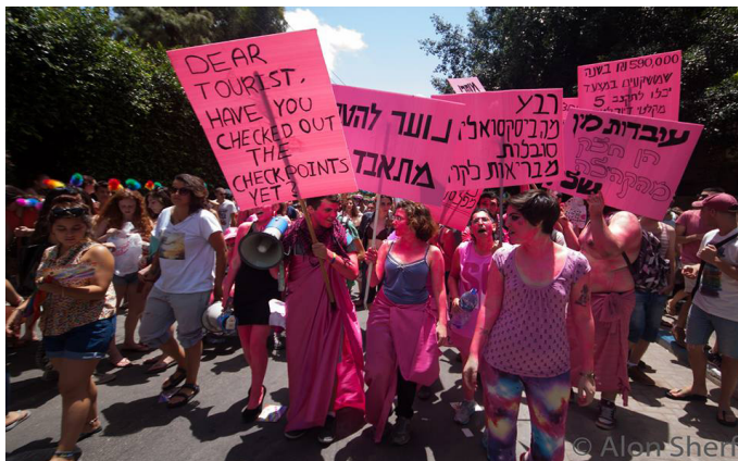
Figure 4. Mashpritzot's protest at Tel Aviv Pride 2013