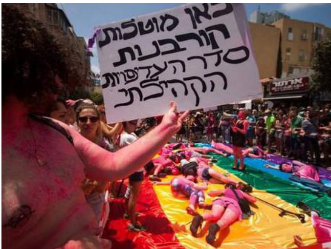
Figure 3. Mashpritzot 's die-in at Tel Aviv Pride 2013