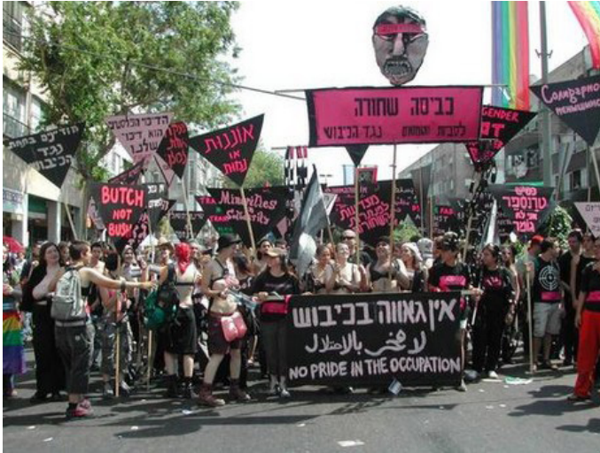
Figure 2. Black Laundry at Tel Aviv Pride 2002 © Black Laundry

Mashpritzot in 2013. Therefore, in order to fully grasp the political significance of the slogan and its affective layers in the context of Israel/Palestine, we first need to give a brief excursus of the historical role played by shame in Israeli queer radical movements, which though small in numbers “have continuously protested the occupation and exhibited solidarity with Palestinians” (ATSHAN, 2020, p. 122).