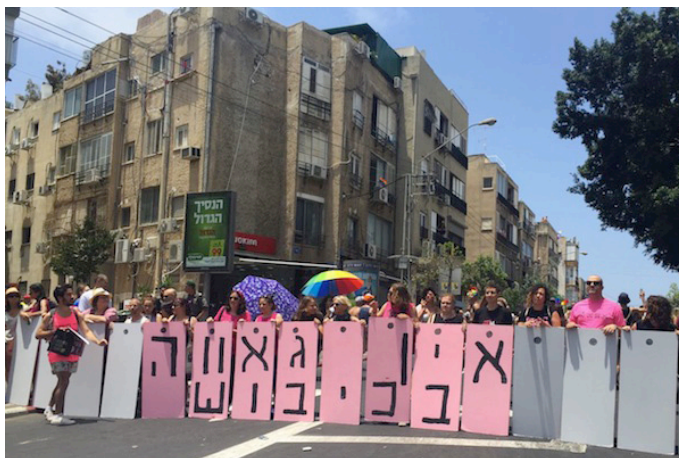
Figure 1. No pride in occupation Tel Aviv Pride 2017

In 2017, however, the bubble was momentarily punctured by a group of activists belonging to a variety of different organisations who teamed together to perform a protest against the yearly Pride parade. Standing behind a row of grey and pink panels with the slogan en gaava ba-kibuš (‘there is no pride in occupation’), the demonstrators briefly stopped the incoming celebratory pageant before being pushed towards the sidewalks by the police and shouted at by the supporters of the right-wing party Likud (see also MAROM, 2017 for a media report on the event).