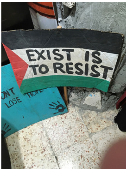
Figure 7. Sign taken at the museum at the Walled Off Hotel in Bethlehem

he transforms the material reality of the checkpoint into a counterpoint in Said's understanding of the term: simultaneously a memento of the reality of the Palestinian present and a material vantage point from which to perform resistance, imagining the possibility of a completely different world.