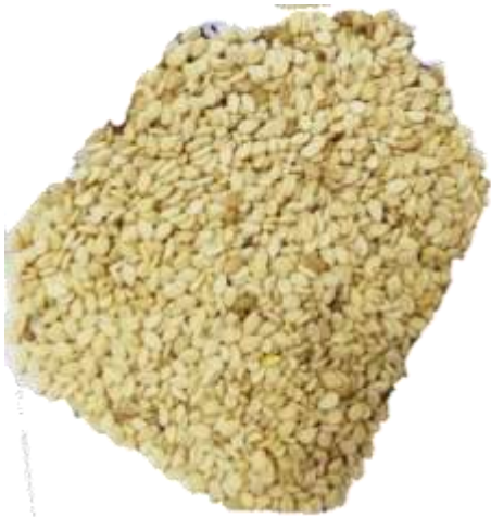
Figure 1. Kodo Millet crop consumed by the patient

Sinus bradycardia; Blood pressure was 90/60mmHg measured from the right upper limb in supine position; Glasgow Coma Scale – E4V5M5 (14/15); pupils normal and were reacting to light; no lateralizing signs; power and tone normal in all limbs. The primary adjunct point of care ultrasound showed ‘A’ profile with lung sliding in the Lung ultrasound, Inferior vena cava distensibility index 50% collapsible, 2D ECHO suggestive of normal left ventricular function, and serum calcium levels were 9 mg/dl.