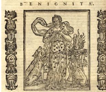
Fig. 27. Ripa, Benig.