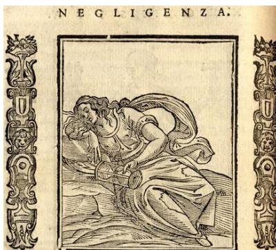
Fig. 21. Ripa, Negligence.