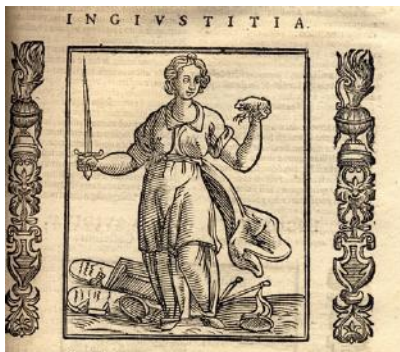
Fig. 20. Ripa, Injustice.