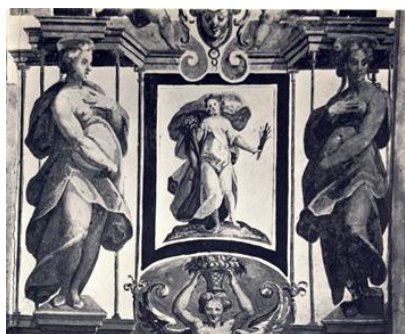
Fig. 13. Arpino, Abundance Vatican.