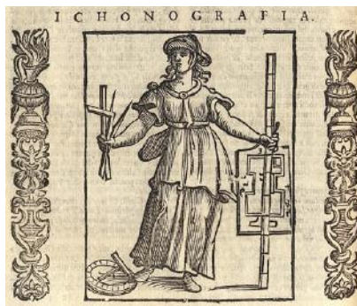
Fig. 10. Ripa, Iconography.