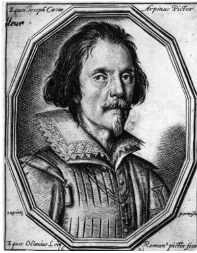
Fig. 3. Giuseppe Cesari, Cavalier D'Arpino, Self-Portrait, 1620-22, from Cavalier Ottavio Leoni, Portraits of some painters of the seventeenth century, designed and engraved in copper by, with the lives of the same taken from various authors with added annotations (Rome: Rossi, 1731).

Photo credit: Hunterian Museum & Art Gallery collections, University of Glasgow, Glasgow, Scotland, Catalogue number GLAHA 54203.