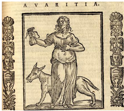
Fig. 8. Ripa, Avarice.