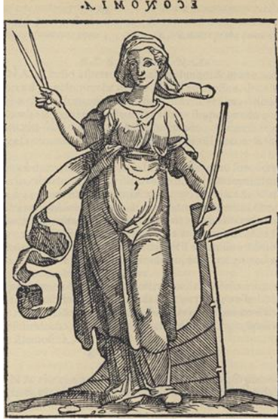
Fig. 19. Ripa, Economy.