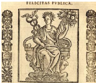
Fig. 24. Ripa, Felicity.