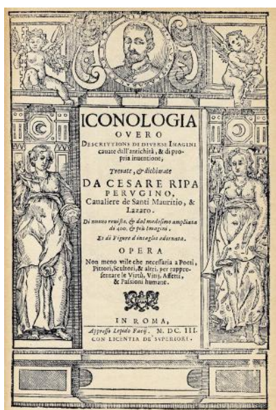
Fig. 2. Cesare Ripa, Frontispiece, Iconologia , Rome: Lepido Facii, 1603.

Cesare (Giovanni Campani) Ripa's Iconologia ( Overo, Descriptione Di Diverse Imagini caute dell'antichita, & di propria invenzione , Figs. 1 and 2) is a comprehensive dictionary of personifications, imagini or figurazioni (images or figurations)[1]. Ripa explains his purpose in composing the images: