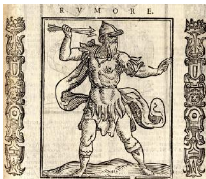
Fig. 17. Ripa, Rumore.