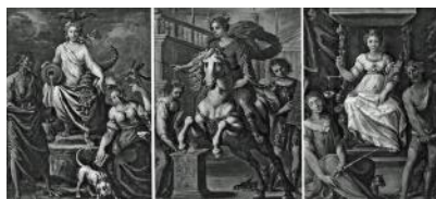
Fig. 32. Cheney's Reconstruction.

emblems or who wish to organize “feste e spettacoli” (“feasts, royal entries or manifestations”). He also defines the derivation of the term iconology , which is from “two Greek words: icon meaning image and logia meaning speaking ( parlamento ). Thus, Iconologia signifies the reasoning of the images because they describe an infinite number of figures based on texts and famous discourses, which explain their meaning.” Ripa’s collection of images or figurazioni is a manual of allegorical interests concerning human passion, virtues and vices, as well as natural phenomena.