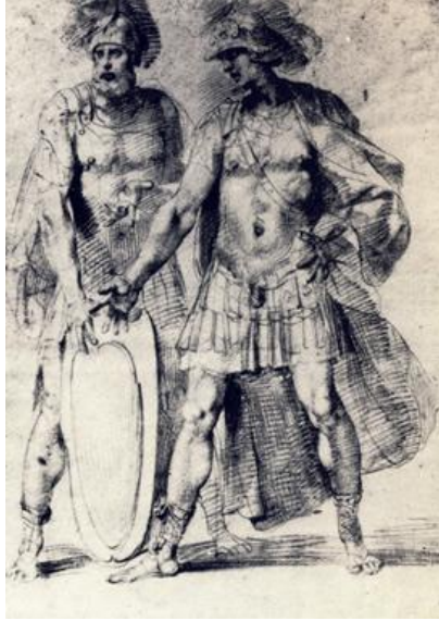
Fig. 16. Arpino, Warrior.