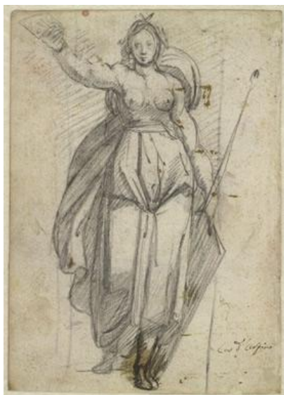
Fig. 18. Arpino, Minerva.

associated with the conceit ( conchetto ) of paragone still an intriguing topic of discussion, not only for contemporary humanists but also for artists and writers such as Leonardo Da Vinci, Michelangelo (1475-1564), Giorgio Vasari, Guido Reni (1575-1642), Benedetto Varchi (1503-1565), Annibale Caro (1507-1566), Paolo Giovio (1483-1552), and Giovan Pietro Bellori (1613-1696)[13].