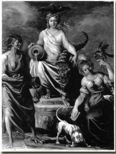
Fig. 5. Giuseppe Cesari, Cavalier D' Arpino, Allegory of Liberality, 1624. Musei Civici di Arte e Storia, Pinacoteca Tosio Martinengo, Brescia.