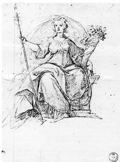
Fig. 14. Cavalier d'Arpino, Abundance. Drawing. Florence, Uffizi. Gabinetto Disegni e Stampe.