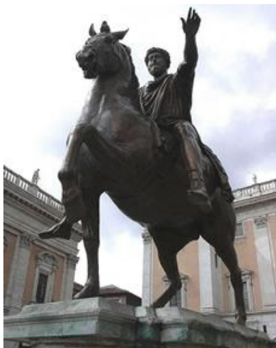
Fig. 28. Statue of Marcus Aurelius. Bronze. Rome, Piazza del Campidoglio.