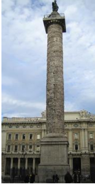
Fig. 30. Column Marcus Aurelius.