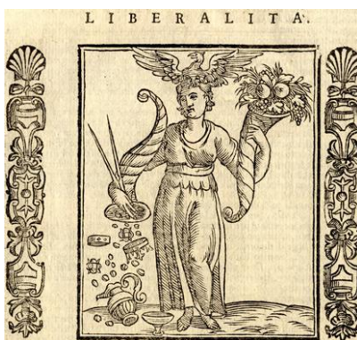
Fig. 22. Ripa, Liberality.

Michelangelo, Jacopo Pontormo (1494-1557) and Vasari. In Varchi's 1549 publication, Due Lezioni (Two Lectures), he summarizes the debate by noting that all the arts are the same since their quest is the same—to create[14]. Vasari, however, clarifies the concept of similarity in his third Preface of the Vite of 1568, by considering disegno (drawing) to be the foundation of all the visual arts.