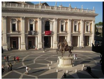
Fig. 31. Campidoglio.