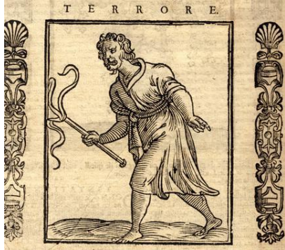
Fig. 12. Ripa, Terrore.