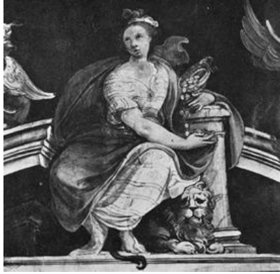
Fig. 23. Arpino, Liberality Vatican.