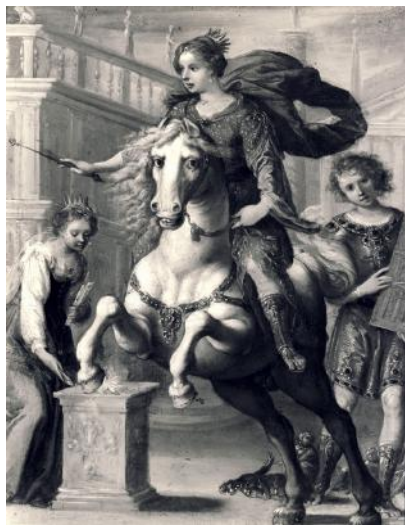
Fig. 6. Giuseppe Cesari, Cavalier D' Arpino, Allegory of Magnanimity, 1624. Musei Civici di Arte e Storia, Pinacoteca Tosio Martinengo, Brescia.