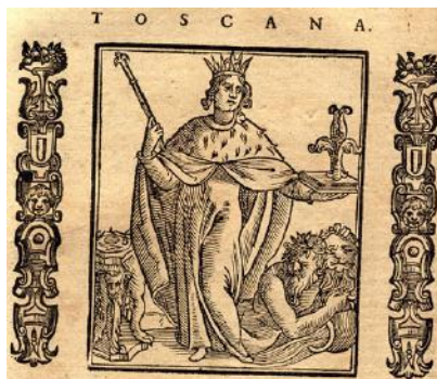
Fig. 9. Ripa, Toscana.