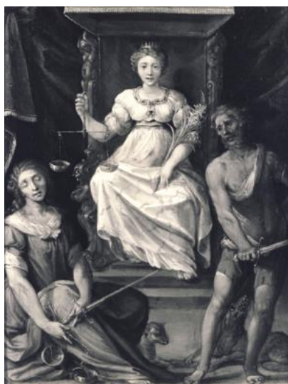
Fig. 4. Giuseppe Cesari, Cavalier D'Arpino, Allegory of Justice, 1624. Musei Civici di Arte e Storia, Pinacoteca Tosio Martinengo, Brescia.

Catalogue number GLAHA 54203.