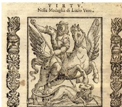
Fig. 29. Ripa, Virtù.