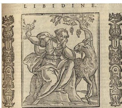
Fig. 26. Ripa, Libidine.

1940 on the signification of the images and the design for the images of Cesare Ripa and Cavalier d'Arpino, few attempts have been made to study the contribution of Cavalier d'Arpino in the Iconologia [18] . This presentation aims to remedy this, in part, and demonstrate the importance of the collaboration between artist and writer.