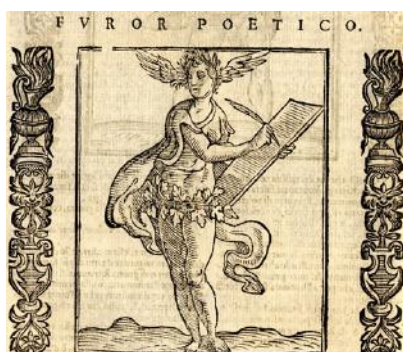
Fig. 11. Ripa, Furor.

Throughout the Renaissance, secular paintings were habitually painted according to the instructions of such humanists who assembled, assimilated and adapted subjects from classical mythology into complex and allusive schemes. However, in the later Cinquecento, with the new enthusiasm for depicting elaborate programs in Rome during the late sixteenth and early seventeenth centuries, and with the eagerness of Pope Urban VIII and his circle in encouraging the expansion of the fine arts as well as the belles lettres , the need for a visual compendium as well as a literary encyclopedia of moral allegories or personification seemed necessary[8]. The Iconologia of Cavalier d'Arpino and Cesare Ripa fulfills that need and also functions as a compilation of previous emblematic and mythological books and a guide for future emblematic books and artistic manuals.