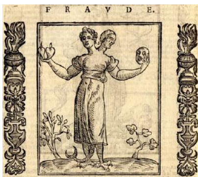
Fig. 25. Ripa, Fraude.