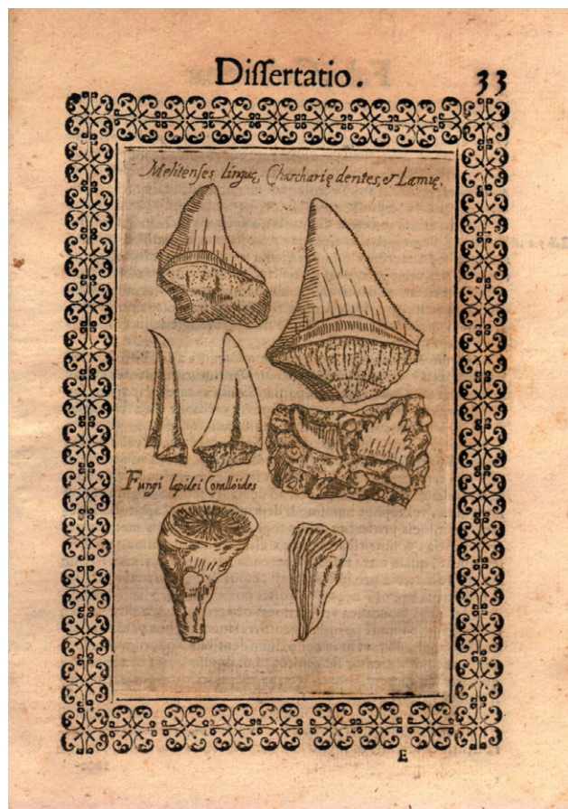
Figure 1. Engraving of fossils from Malta, interpreted as shark teeth (“ Melitenses linguae, charchariae dentes et lamiae ”) in Fabio Colonna’s De purpura, aliisque testaceis rarioribus , appendix to his Ekphrasis of 1616. Some fossils are portrayed within the encasing rock. Creative commons, public domain.

ans went hand in hand with the humanistic textual approach transmitted by the scholastic tradition.