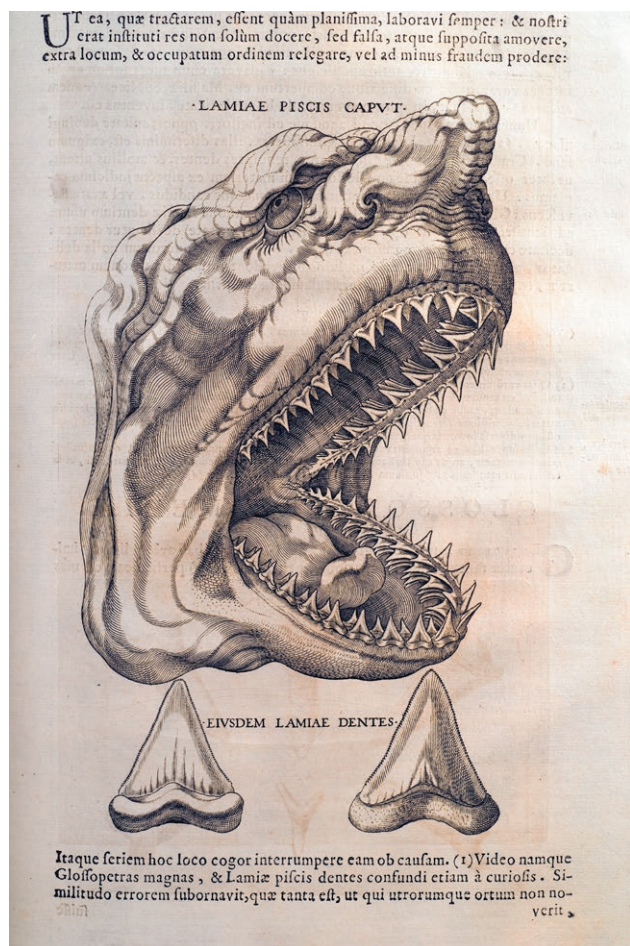
Figure 3. Portrait of a shark's head by Anton Eisenhoit (1553-1603), originally engraved around 1590 for Michele Mercati's Metallotheca Vaticana (published posthumously in 1717) and used by Steno in 1666 to illustrate his Canis carchariae dissectum caput.

had found in Tuscany the perfect place to immediately set out to work and study the natural setting where fossils were found, finally merging history of the earth with animal anatomy and corpuscular theory. 73