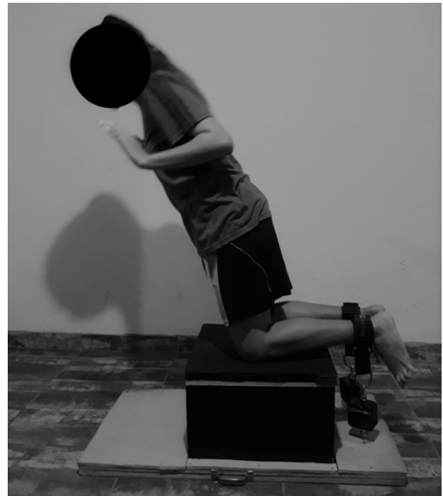
Figure 1: Assessment of eccentric knee flexor strength during the NHE execution.

Briefly, the participant was positioned to perform the NHE on a platform, and commercially available load cells (E-lastic; E-sporte Soluções Esportivas, Brasilia, Brazil) with simultaneous transference of data via Bluetooth were fastened around their ankles (right above the lateral malleolus). The participant was instructed to execute the NHE as the following: from the initial position (kneeling, the hip neutral and the torso upright), lay the torso forwards using only the knee joint (e.g., without altering the position of hips or spine), in slow speed and using the hamstring muscle eccentrically during the entire range of motion to avoid the torso acceleration to the floor. The participant should have to use their upper limbs to absorb the fall and to return