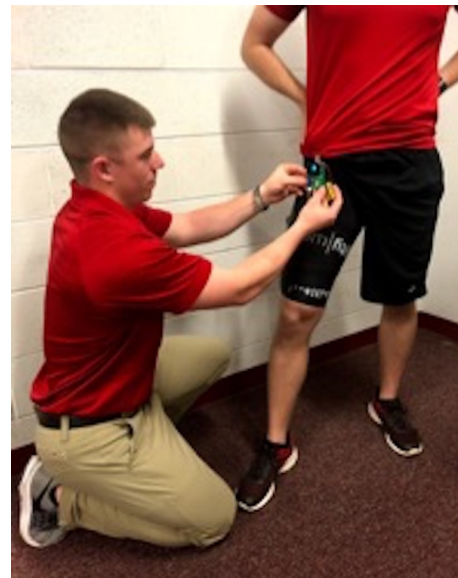
Figure 3: TekScan Pressure Sensor

Even though this study is the first to the authors' knowledge to examine the effects of flossing over muscle bellies, other researchers have examined the effects of tissue flossing on joints, specifically the ankle and the shoulder. 1,3,4 These studies have all found clinically relevant improvement in ROM of the ankle and shoulder after the application of a floss band. Researchers have claimed that occlusion and reintroduction of blood flow helps to improve ROM. 2 Clinically, this theory supports the use of floss bands not only