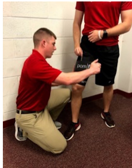
Figure 2: Application of Floss Band