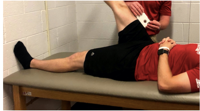
Figure 1: Straight leg raise range of motion test

For flexibility, the interaction between time and session was significant ( F_{2,40}=17.54 , p<0.001 , \eta^2=0.47 ; Table 1). Figure 4 illustrates the means for each group at pre-test and post-test. Post hoc tests for flexibility showed significant differences between pre- (86.14±8.06 degrees) and post-test (90.81±7.69 degrees) for the floss session ( p<0.001 , Mean Difference=4.67 degrees, CI_{95}=3.35-5.98 ). In addition, post hoc tests revealed significant differences between pre- (87.67±7.51 degrees) and post-test (89.86±7.88 degrees) for the sham session ( p=0.001 , Mean Difference=2.19 degrees, CI_{95}=0.98-3.40 ). For jump power, the interaction between time and session was not statistically significant ( F_{2,40}=1.82 , p=0.18 , \eta^2=0.08 , 1-\beta=0.36 ; Table 2).