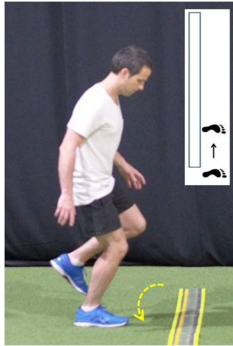
Figure 6: The Single Lateral hop for Distance (LHD) Test, whereby the patient had to hop off one leg in a lateral direction as far as possible, landing in a controlled manner on the same limb.

It is important to note that the current study employed a range of hop measures commonly reported in the literature and/or used routinely through our clinical institution. However, a range of other hop tests have been reported in addition to those employed in the current study including, though not limited to, the triple medial hop for distance, 24 the 90° medial rotation hop for distance, 24 the single timed lateral hop 25 and 30s side hop test, 15 the timed