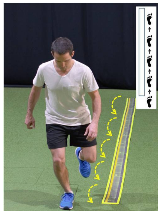
Figure 2: The 6m Timed Hop (6MTH) Test, whereby the patient had to hop on one limb as fast as possible over a distance of 6 metres.

eight hop tests, calculated by dividing the peak values on the operated limb by that recorded on the non-operated