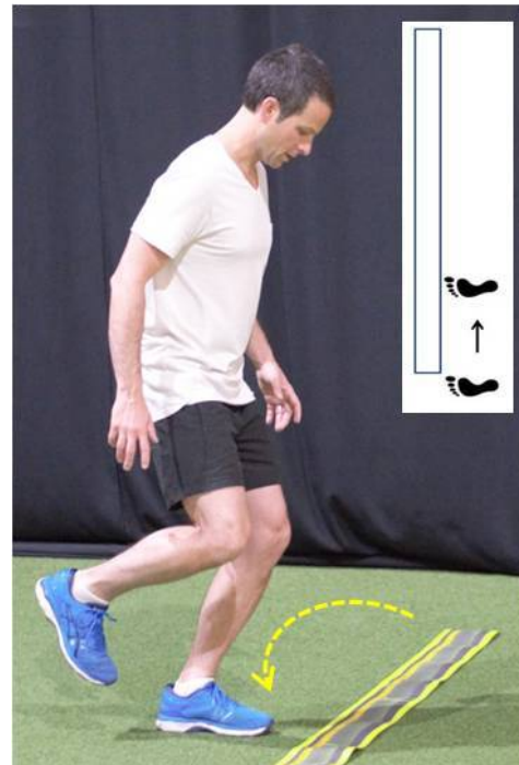
Figure 5: The Single Medial Hop for Distance (MHD) Test, whereby the patient had to hop off one leg in a medial direction as far as possible, landing in a controlled manner on the same limb.

Furthermore, it should be acknowledged that despite their widespread use, many of these single limb hop tests are straight line movements (apart from the TCHD which