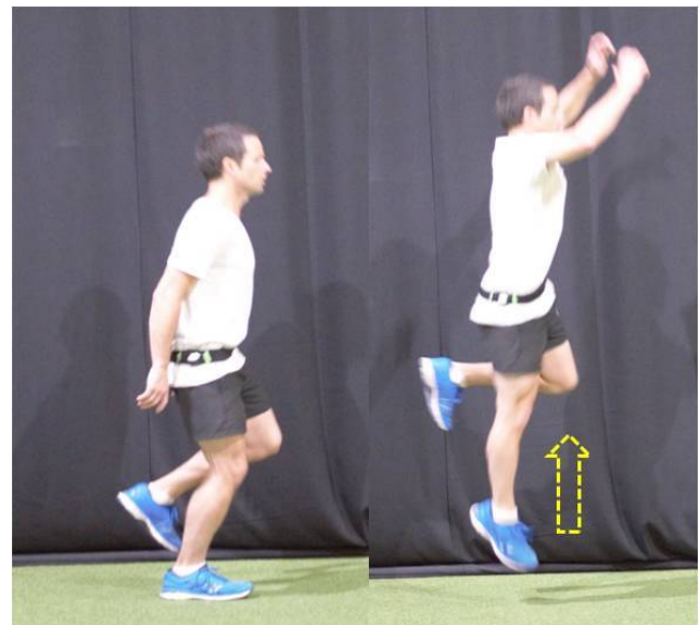
Figure 7: The Single Leg Countermovement Jump (SLCMJ) for Height, whereby the patient had to hop off one leg as high as possible, landing in a controlled manner on the same limb.

square hop, 15 the figure-of-eight timed hop test, 26 and a drop jump followed by a double hop for distance. 15 While we sought to manage the role of fatigue via hop test randomisation and providing patients the rest time they felt they required, incorporating more hop tests may have jeop-