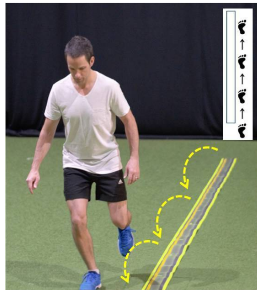
Figure 3: The Triple Hop for Distance (THD) Test, whereby the patient had to undertake three consecutive hops in a forwards direction, landing in a controlled manner on the third hop.

While the majority of patients demonstrated an LSI \geq 90\%