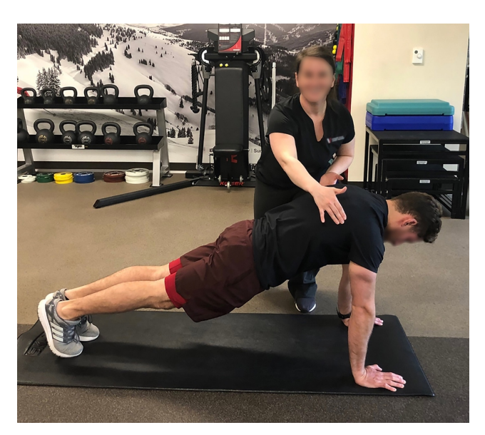
Figure 8: Push-up plus exercise with perturbations.

Once the patient has met the criteria listed in Table 4, they can begin power exercises, which typically occurs five months post-operatively. The goal of this portion of phase IV is to further enhance dynamic stability with advanced overhead activities, while introducing explosive muscular power with sport or occupational specific movement patterns. Plyometric exercises play an important role in the progression of rehabilitation and the development of power. It has been shown that plyometric exercises lead to increased shoulder power, endurance, enhancement of joint position sense and kinesthesia, and increased throwing power compared to isotonic exercises alone.<sup>47</sup> Introduction to plyometric exercises can be accomplished by performing two-handed drills and progressing to one handed drills. For example, the patient can perform a two handed chest pass to a rebounder using a weighted medicine ball and then work towards higher levels of shoulder elevation,