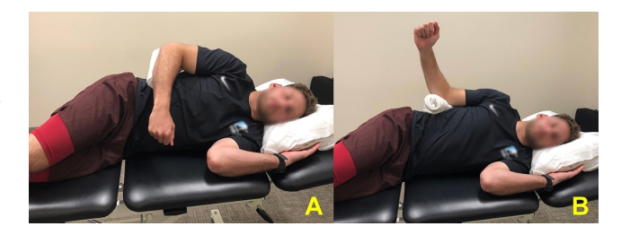
Figure 3: Side lying External Rotation. (A, start position and B, end position).