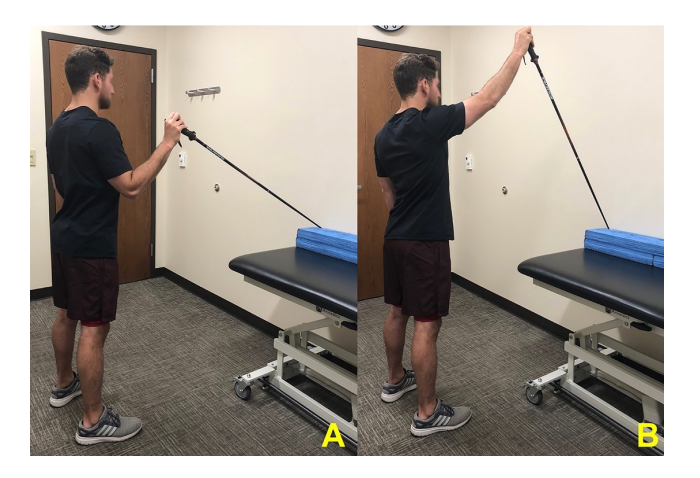
Figure 1: Active assisted forward flexion using a ski pole or dowel (A, start position and B, end position).

Endurance of the scapulothoracic musculature in concert with the rotator cuff is key to establishing proper scapulohumeral rhythm and stability with active motion.<sup>34</sup> The