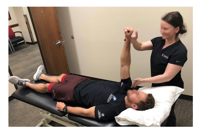
Figure 5: The "Supine Punch" Exercise with external perturbations.

Initial resistance strengthening is introduced once criteria in <u>Table 2</u> have been met and the patient is at least eight