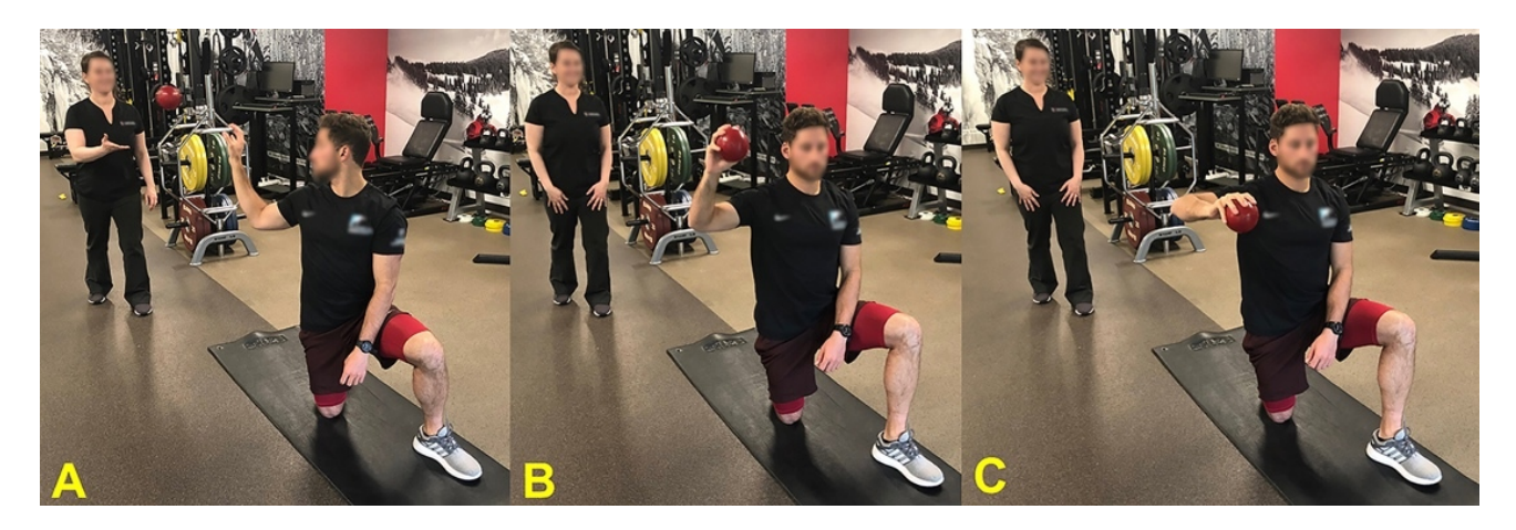
Figure 9: The Reverse Throw Progression

Completion of 60 sec 2lb med ball bounce at 165 beats per minute Complete 6lb throw >90% distance of contralateral side >21 touches in 15 seconds >90% distance of contralateral side (Normalized score)