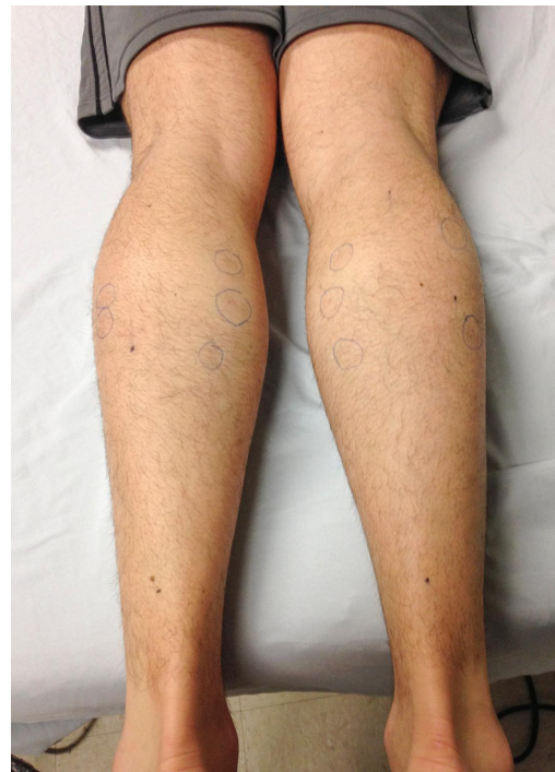
Figure 1: Trigger Points Palpated (Circled)

Individuals meeting inclusion criteria were randomly blinded and placed into either the experimental or control group. The subjects were barefoot and wore athletic cloth-