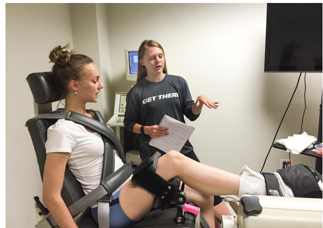
Figure 3: Biodex Measurement Set-up

The assessors were not present during the DN or sham DN. The DN was performed in the five previously palpated and circled trigger point locations on each calf using a clean technique with sterile needles. Needles were inserted into the triceps surae and repeatedly moved up and down in order to elicit a twitch response. All DN participants had twitch responses during the DN intervention.