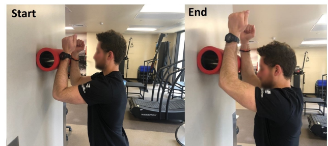
Figure 3. Wall slides to help activate the serratus anterior.

during performance of any exercise throughout the ROM. Placing an unstable base under the upper limb such as a stability ball enhances neuromuscular control. Adding perturbation to the exercise challenges proprioception and improves joint position. 45 CKC exercises stress the joint in a weight-bearing position, resulting in joint approximation. Advancing from wall to tabletop or to quadruped position (Figure 5) creates a gradual increase in loading and is excellent for scapular control. 46,47 Additionally, performing exercises that introduce chaos can be beneficial for increasing core stability and rotator cuff recruitment. An example would be chaos band training, such as performing an overhead press with added weight suspended to the barbell, using looped bands. This would add instability and unpredictability to the exercise.