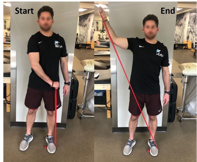
Figure 4. PNF D2 movement pattern with resistance. The movement pattern is diagonal and spiral in nature and crosses midline.

The main goal of this phase of rehabilitation is to maximize power development. Power equals force times velocity. Since force production was the biggest focus of Phase III,