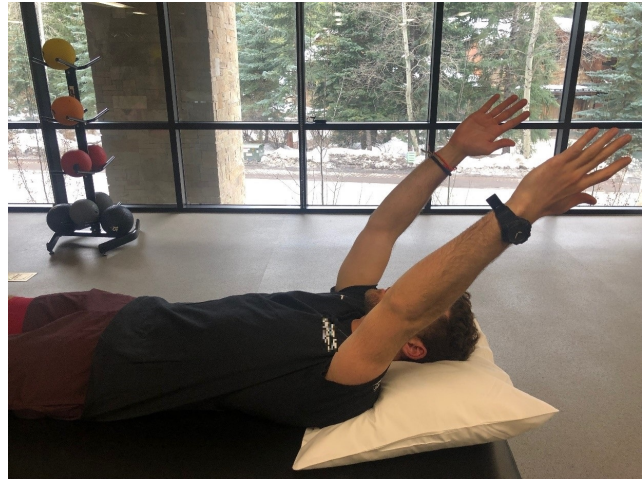
Figure 2. Joint position sense exercise: Patient in supine position with closed eyes. First, the uninvolved extremity is actively moved, then the affected extremity is moved to as close to that position as the uninvolved extremity.

Dynamic stability can be enhanced through progression of neuromuscular control techniques, including reactive neuromuscular control drills and closed kinetic chain (CKC) exercises. RS exercises at this phase can be incorporated