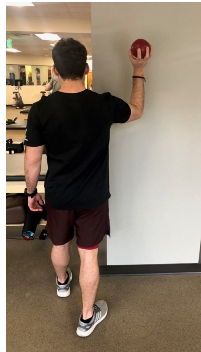
Figure 7. 90/90 Wall dribble performed as an OKC exercise.

athletes given their predictive validity related to throwing distance as compared to other functional tests. 60 Analysis revealed that the modified pull - up test was the best predictor of a softball throw for distance as it had the highest correlation with the distance thrown ( r = 0.70 ), followed closely by the push up test ( r = 0.63 ). 60,61 Normative values are based on testing of recreational athletes so these goals would be the bare minimum an athlete should aim to achieve.