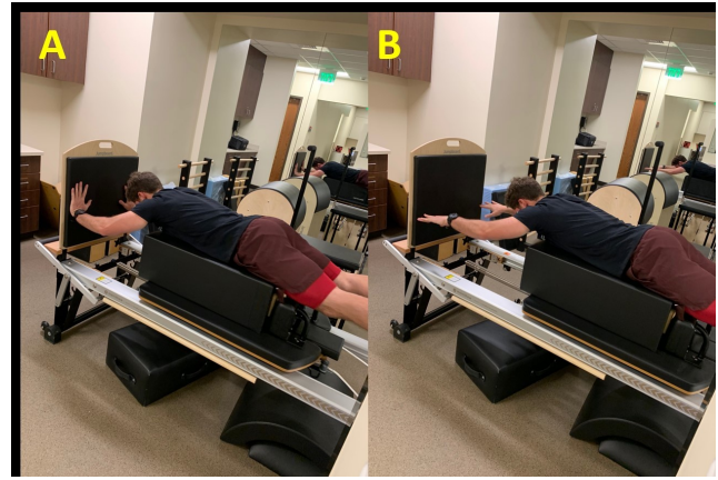
Figure 8. Plyometric UE jumps at start position (A) and end position (B) on Pilates reformer.

This clinical commentary describes a criterion-based rehabilitation protocol following Latarjet procedure in an athletic population. It describes progression through clearly defined phases and recommended criteria to achieve prior to progression into the next phase. Phase I focuses on pro-