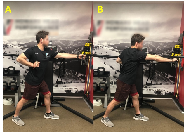
Figure 6A, 6B. Push-pull arm cable exercise.

Negrete et al reported that the modified pull up and push up tests may be beneficial assessment tools for throwing