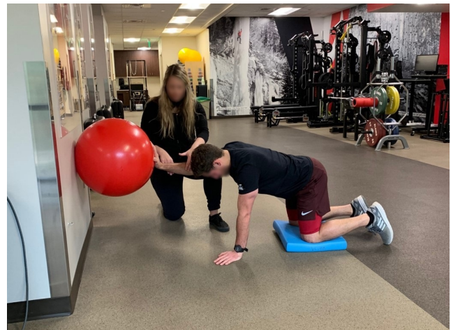
Figure 5. Rhythmic stabilization in quadruped position. The right limb is in an overhead, closed chain position.

the incorporation of velocity into Phase IV will maximize power generation. Based on available evidence, the following guidelines for dosage are recommended when designing a power program for the shoulder. 31,43,54,55 The athlete should work at 80-100% of their 1RM for 3-6 repetitions for 3-6 sets. Functional trainers are cable machines which allow unrestricted multiple planes of motion. They can be a good tool to accomplish power production, with the ability to perform basic exercises like the 90/90 ER for power or progressing to a push-pull arm cable exercise which incorporates the entire kinetic chain (Figure 6).