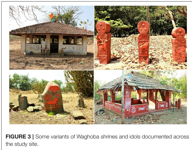
FIGURE 3 | Some variants of Waghoba shrines and idols documented across the study site.

Waghya , Waghjai , Bagheshwar , Waghjaimata (female form), with Waghoba being the most commonly used name in our study site (Gadgil and Malhotra, 1979; Newman, 2012; Ghosal and Kjosavik, 2015; Athreya et al., 2018). Waghoba is derived from the Marathi words “ wagh ” which means big cats and “ ba ,” a term assigned to an elderly or paternal figure in the community. The interviews revealed that the people in this landscape perceived leopards and tigers to be alike and considered them both to be a form of Waghoba. The word wagh is similar to the Hindi word bagh , which is used to refer to both the tiger and the leopard in other parts of India (Mathur, 2016); which indicates that people in this landscape have their own taxonomic categorization of these species which may not be concordant within the specifics of modern scientific taxonomy (Shull, 1968; Landy, 2017).