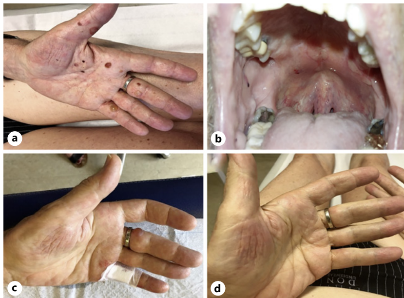
Fig. 1. Clinical presentation of BP induced by pembrolizumab. a Initially at diagnosis with tense blisters on the palmar face of hands. b Mucosal erosion of the hard palate. c, d After 4 weeks and after 8 weeks of tapering oral prednisolone. BP, bullous pemphigoid.

detachment of the epidermis with chronic inflammatory infiltrate characterized by eosinophilic granulocytes. Immunohistochemistry against collagen IV, the main substance located in the lamina densa of basement membrane, showed its attachment to blister base. Direct immunofluorescence showed linear deposition of immunoglobulin G and C3 complement at basement membrane zone (shown in Fig. 2). These histopathological features are consistent with a BP.