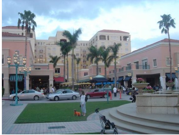
Mizner Park in Boca Raton, FL

Another project that has been received with great success thus far is the new Metropolitan Midtown redevelopment in Charlotte, NC. This greyfield site, less than 1 mile from downtown Charlotte, is the location of the former Midtown Mall, the first enclosed mall in Charlotte, and was built by The Rouse Company in the 1960s. 15 The developer of the parcel, Pappas Properties, has initiated a lottery to pre-sell its residential condominiums due to high demand. 16 The marketing tagline for the development is: “Life is what happens when you’re not in your car,” and is attempting to appeal to those weary from increasing traffic and congestion in the greater Charlotte area. 17 Similar to the growth of the Washington DC area and Boca Raton-West Palm Beach MSA, the Charlotte MSA experienced a 30% increase in population growth from 1990-2000, with continued annual population growth expected at 3.6%. 18 This population growth should help ensure strong market demand for the project, similar to Market Commons in Arlington and Mizner Park in Boca Raton.