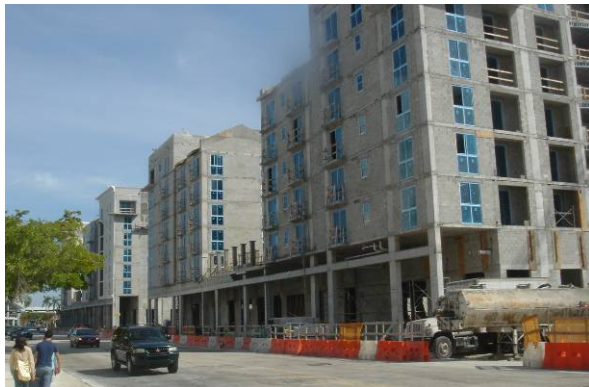
The new Downtown Kendall under construction Mixed-use buildings with underground parking shown

complexity ( K_0 ), market challenges such as absorption and poor demographic conditions ( V_0 ), or delayed regulatory approval ( \alpha ). For example, in Kendall, FL, just south of Miami, a 350-acre transit-oriented redevelopment of an existing mall and adjacent parcels encountered resistance to densification from the nearby affluent Coral Gables neighborhood. As a result, the height limits of some of the buildings were restricted. 2 A reduction in density reduces the overall value of completed improvements, V_0 . The project also incurred significant cost overruns, K_0 , due to unexpectedly hitting water during construction of the 2-story underground parking decks. 3 The 12-month delay caused by this construction challenge had a ripple effect through the timing of completion for the mixed-use town center buildings and remaining master plan implementation. Delays such as these can be difficult to quantify in terms of additional financing costs incurred or a strong residential condominium market that may be missed, but they are representative of general redevelopment challenges which greatly impact a project's ability to achieve a positive NPV in the redevelopment model.