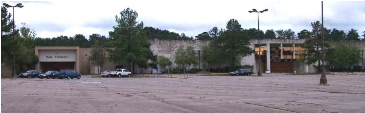
Failed Regency Mall in Augusta, GA

As previously mentioned, greyfields have been traditionally defined as failed retail malls, typically ranging in size from 10 acres to more than 100 acres. 1 For a retail mall to reach “failed” or greyfield status, the mall will likely have at least 15% vacancy with sales per square foot averaging less than 50% of what a successful mall would earn on a per square foot basis. 2 Many greyfield malls earn less than $120 per square foot, whereas a successful mall can earn upwards of $300 per square foot. 3 Additionally, most malls in greyfield status were originally constructed in the 1960s and have not been renovated for at least 7-8 years. 4