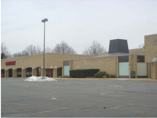
Current photograph of Tysons Corner greyfield project

This photograph gives a sense of the current conditions that will need to be overcome to successfully market and develop the proposed improvements.