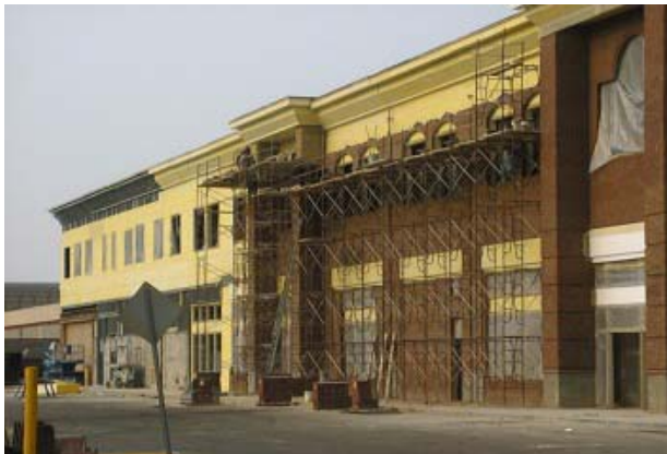
Eastgate Mall under construction, 1998

years have since passed, neither redevelopment has begun constructing the residential portion of the program due to poor market conditions for housing in the immediate area. Both malls have been “turned inside out” to gain the aesthetic of true town centers, but neither has been able to implement its housing strategy due to the residential market simply not being there. Apparently, these sites have not overcome their perception as retail-only destinations to warrant construction of residential housing. The lack of demand for residential housing in both of these redevelopments may be partly due to the location of these sites. Whereas the downtown Kendall project is in close proximity to Miami, FL, Mashpee Commons is not located near any major metropolitan area, with Boston, MA, being more than 60 miles away. The Eastgate Mall project in Brainerd, TN, is, however, less than 10 miles from Chattanooga, TN, which is considered a metropolitan city. Yet, Chattanooga is just the 4 th largest city in Tennessee with a population of only 155,000. 4 This may suggest that proximity to a major metropolitan area is necessary to support a mixed-use concept with a significant residential housing component.