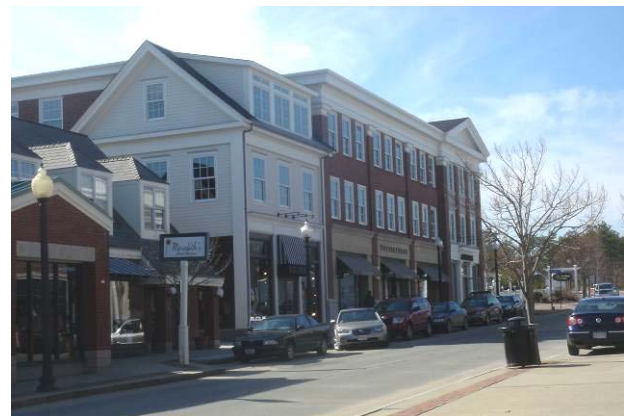
Mashpee Commons retail