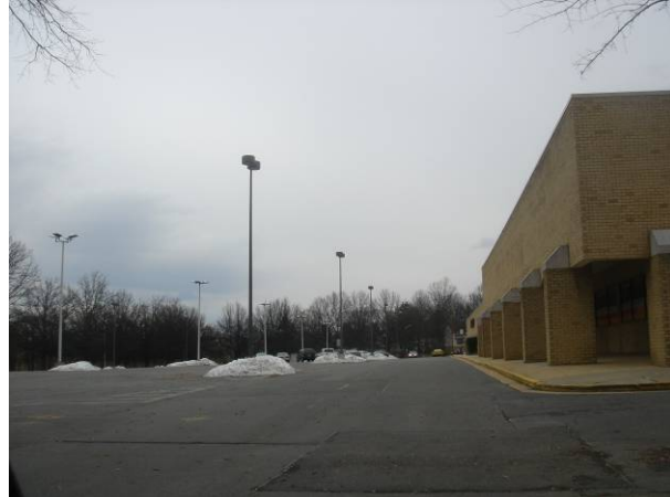
Proposed suburban retrofit in Tysons Corner, VA. Includes a declining apartment complex and failed retail mall.

It is logical to include the concept of suburban retrofitting within the greyfield terminology because many of these sites share similar characteristics. First, the scale of the parcels can be comparable, as apartment complexes, business parks and retail malls typically occupy at least 10 acres of land. Second, in accordance with Euclidean zoning, each of these places is primarily single-use, comprised of only office, retail or residential uses. Third, these sites were constructed in the post-World War II era, coinciding with the rapid rise in car use. Thus, the sites are often located near major thoroughfares or at key intersections and include substantial amounts of parking, often far more acres of parking than acreage actually occupied by buildings. Fourth, these sites are all typically occupied by many tenants under various lease structures, with apartment complexes often having highest number of tenants with the shortest-term leases. Lastly, while these parcels may be leased to many tenants, they are almost always