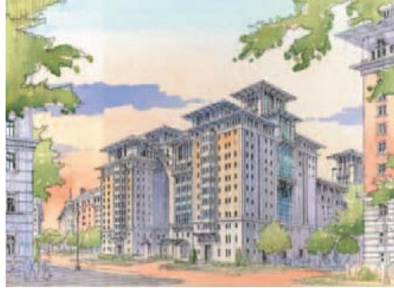
Rendering of proposed redevelopment at Tysons Corner

This photograph gives a sense of the current conditions that will need to be overcome to successfully market and develop the proposed improvements.