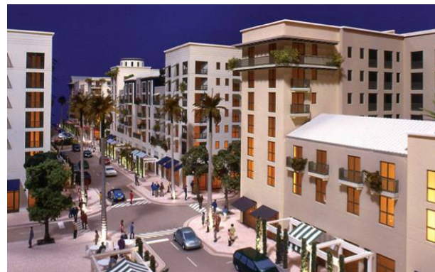
Rendering of same street with completed improvements

Similar to the Downtown Kendall project, the Eastgate Mall in Brainerd, TN, and Mashpee Commons in Mashpee, MA, are two more examples of greyfield sites that involve mixed-use redevelopment proposals replacing formerly single-use retail sites. The Eastgate Mall redevelopment project began in 1998 and Mashpee Commons began in 1986. Despite how many