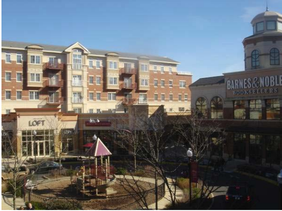
Market Commons at Clarendon in Arlington, VA