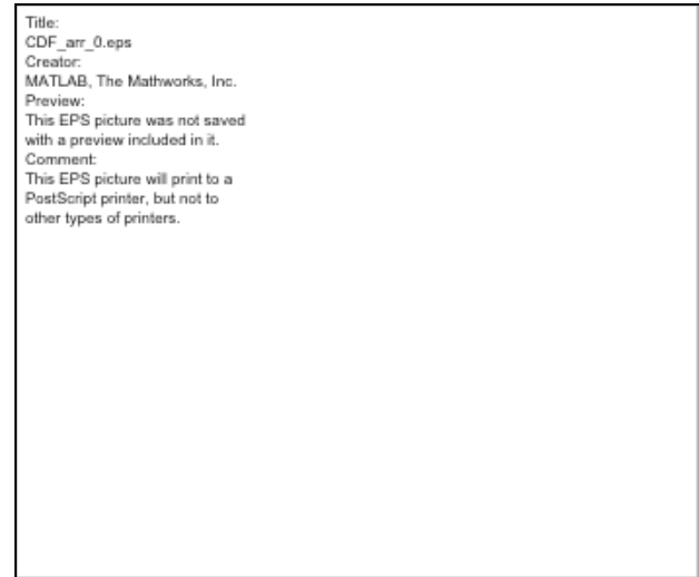
Figure 1: Sample of Visual Output From Web-Based Interface (Calibrated Taxi-Time P.D.F)

from the database; runs the calibration functions; and creates both visual and text-based versions of the results (see Figures 1 through 3). In addition, a taxi-time predictor (described in the “Applications” section) is also provided. Planned upgrades to the web-based interface include automated model validation, improved taxi-time predictors, and an evaluation tool for testing a proposed congestion-control algorithm for departure traffic.