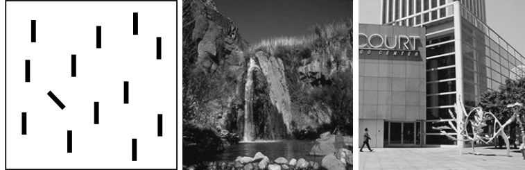
b) effects of scene context on object search.

Fig. 1. a) when object intrinsic information is reduced, then context plays a mayor role in recognition. Now, the object recognition system is not invariant to pose, orientation, location and background. b) Effects of context in masking and providing priors for finding the target.