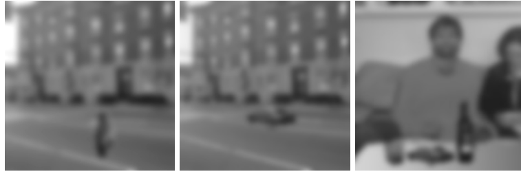
a) effects of scene context on object recognition.