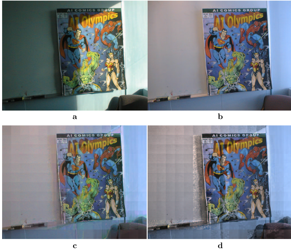
Figure 4: a. Image with strong shadow. b. The same image under more uniform lighting conditions. c. Color flow from a to b using patchwise eigenflows. By clustering flow coefficients, we hope to be able to define the shadow boundary. d. Flow from a to b using the patchwise version of a competitive color mapping model (see [7] for details). Notice the strong artifacts in the competitive color mapping scheme.