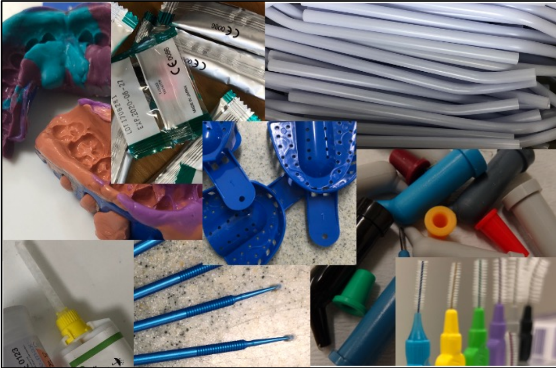
Figure 4. Montage illustrating the variety, volume, and complexity of plastic waste generation from clinical practice.