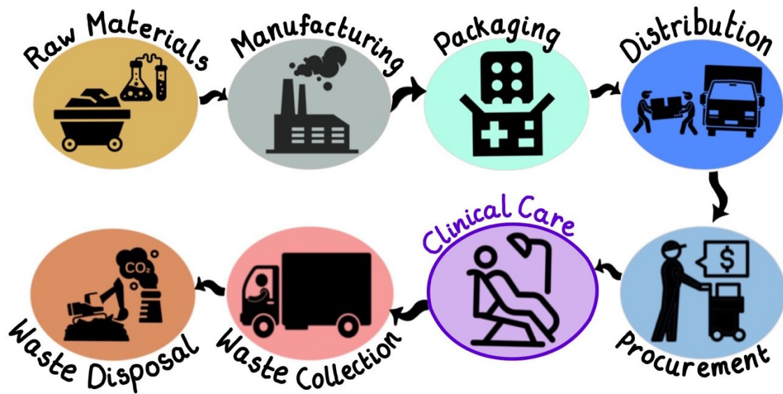
Figure 1: Linear economy supply chain: Mineral extraction, processing and synthesizing of raw materials >> Manufacturing and packaging of the dental restoratives, sundries and equipment products >> Distribution and purchase of these products >> Clinical procedure with further energy expenditure, water use and indirect material use >> Collection and disposal of waste associated with different levels of contamination, mostly managed through landfill and incineration.