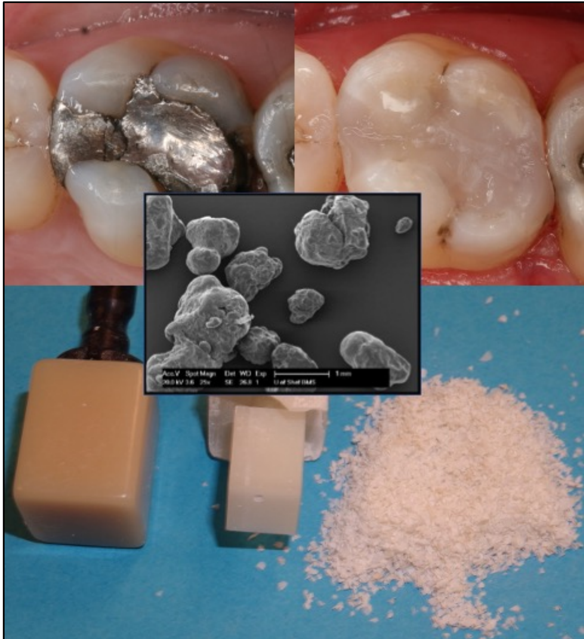
Figure 3: Montage of dental restorations/materials that contribute to pollution. Top - Amalgam restoration replaced with a Resin Based Composite direct placement restoration. Bottom - Example of RBC microparticles created from machining CAD-CAM blocks or from finishing/removal of old RBCs. Centre - Scanning Electron microscope image of RBC microparticles with a scale bar of 1mm.