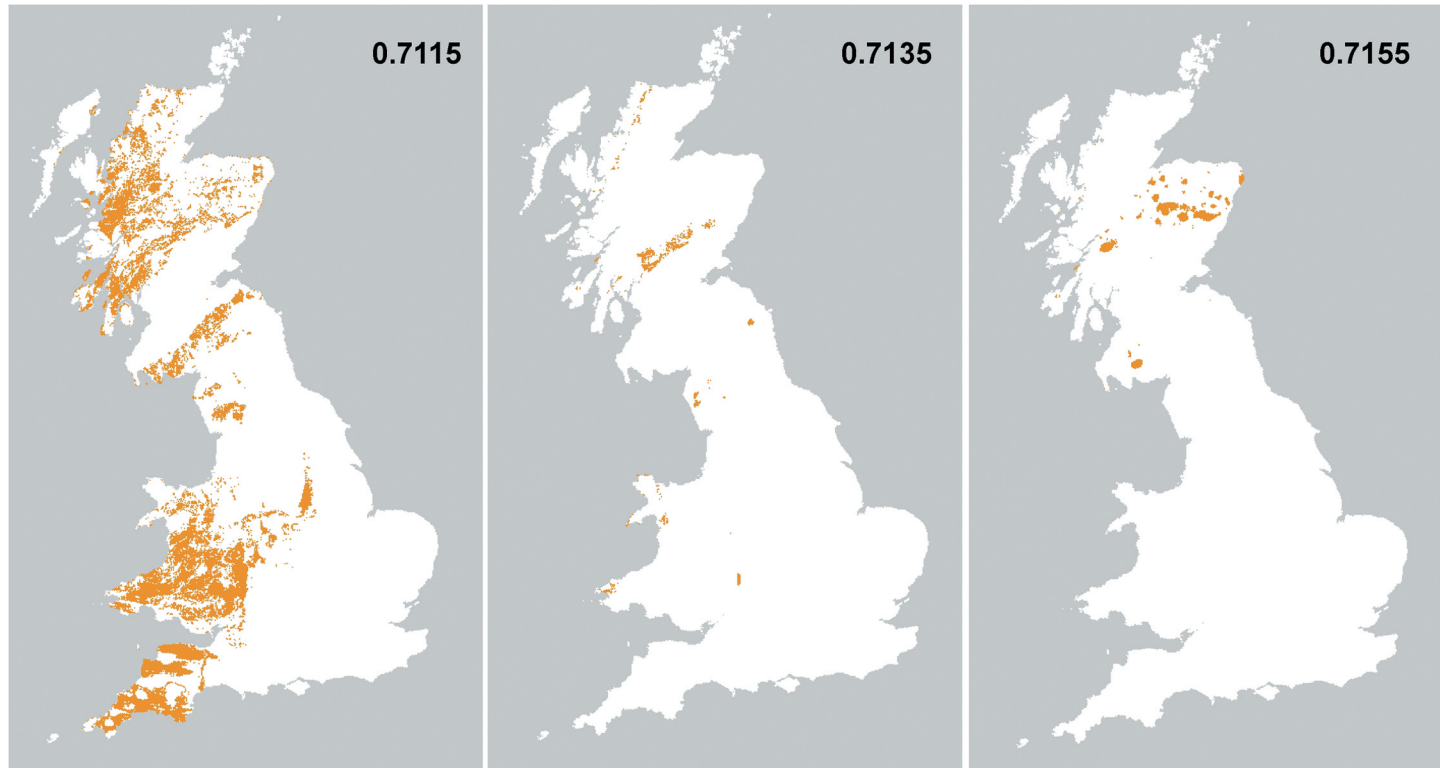
Figure 2. Maps showing areas where domains include values of 0.7115 (left), 0.7135 (middle) and 0.7155 (right), demonstrating how sparse highly radiogenic domains are in the British biosphere based on current mapping (following Evans et al. 2018a). N.B. These maps were not used to pinpoint locations in Madgwick et al. (2019a), but the interactive tool was used to explore the diversity of origins created using BGS Open Access biosphere map https://www.bgs.ac.uk/datasets/biosphere-isotope-domains-gb/ .