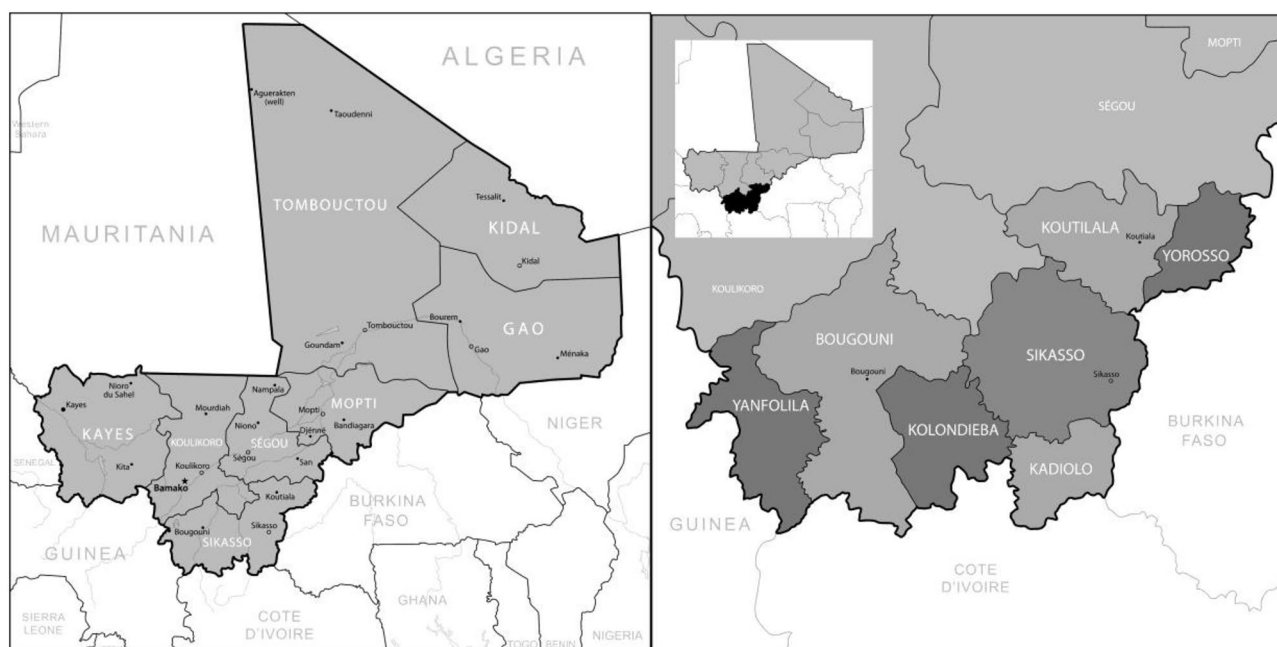
Fig. 1 Map of Mali (left) and districts in the Sikasso region (right)

increasing yields and profits for millions of smallholder producers in China, India, and South Africa (Pray et al. 2002; Qaim and Zilberman 2003; Morse et al. 2004).