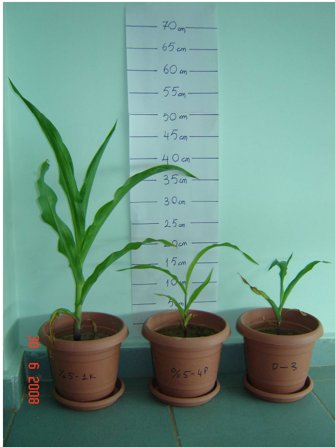
Fig.2. Corn plant development . 1: OSWC application 2: OSW application 3: Control (from left to right)