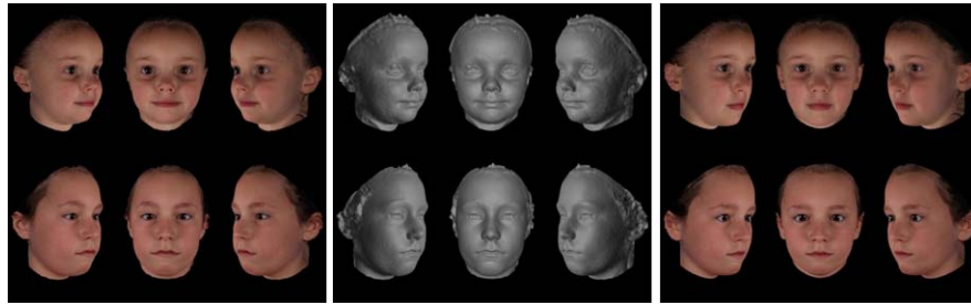
Figure 1. Presentation of the three versions of the stimuli (between subjects), (1) reflectance and shape version (original photograph), (2) shape version (individual shape information retained but surface reflectance information removed) and (3) reflectance version (individual surface reflectance information retained but shape standardized).