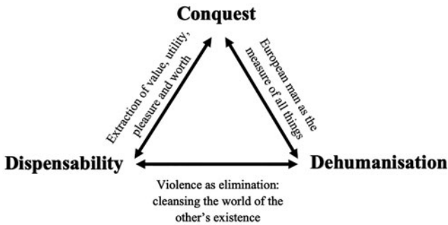
Figure 1. The decolonial triangle of violence.

committed by the Nazi regime in Europe had been preceded and instructed by centuries of similar forms of violence in colonial settlements. In his understanding, the Holocaust was not rendered horrific because it constituted an offense to the very idea and essence of humanness, as Hannah Arendt would have it. 60 The Holocaust was experienced as grotesque because, for the first time, the old colonial procedures that ‘had been reserved exclusively for’ 61 the victims of European colonialism were employed on Europeans themselves.