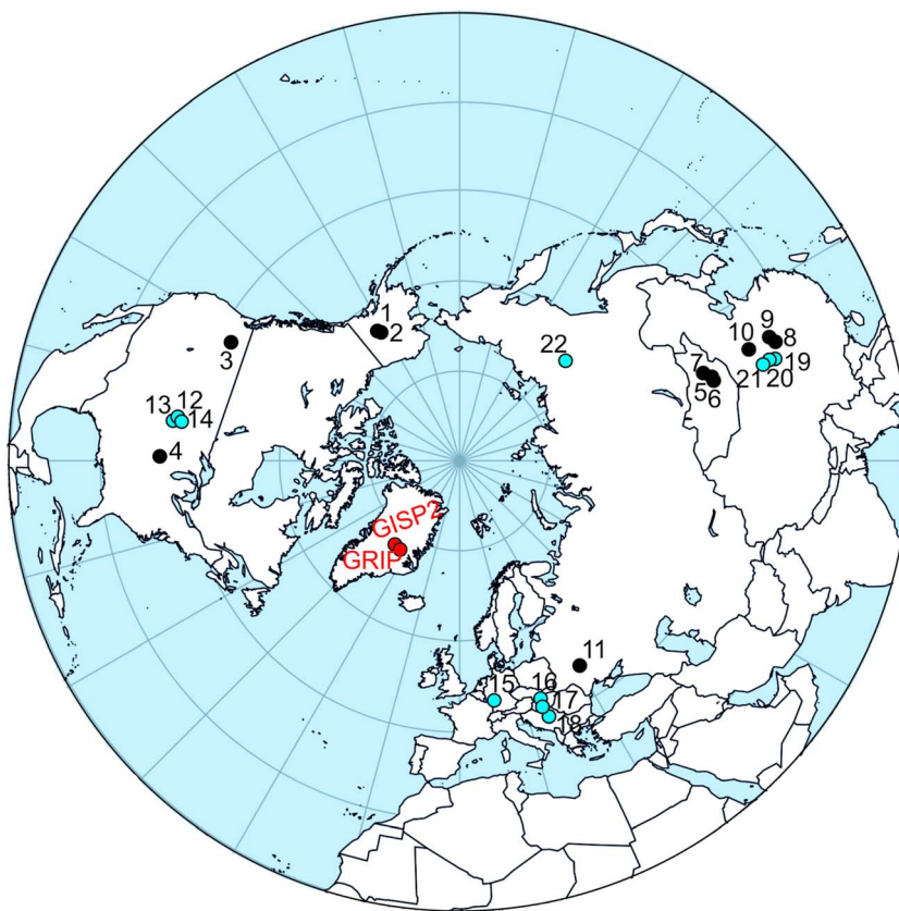
Figure 1. Location of ice cores in Greenland and potential source area (PSA) samples around the Northern Hemisphere. Black dots denote PSAs analyzed by Biscaye et al. [1997] and Svensson et al. [2000]: 1 and 2. Moose Mountains, AK, U.S.; 3. Pullman, WA, U.S.; 4. Pancake Hollow, IL, U.S.; 5–7. Gobi desert; 8. Weinan, China; 9. Luochuan, China; 10. Yulin, China; and 11. Muzichi, Kijev, Ukraine. Blue dots denote PSA samples analyzed in this study: 12. Judkins, NE, U.S.; 13. Prairie Lake, NE, U.S.; 14. Obert, NE, U.S.; 15. Nussloch, Germany; 16. Mende, Hungary; 17. Dunaszekcső, Hungary; 18. Titel, Serbia; 19. Lingtai, China; 20. Xifeng, China; 21. Beigoyuan, China; and 22. Tumara Valley, NE-Siberia, Russia.

to be >1 – 2 [ Scheuvs et al. , 2013], whereas in a boreal climate it is <0.5 – 1 [ Griffin et al. , 1968]. Beyond latitude-indicating species, any source area has a characteristic spectrum of clay minerals, partly reflecting local lithology and climate and drainage characteristics. Source area discrimination is therefore a matter of comparing relative abundances of an entire suite of minerals, some of which may be diagnostic, while others are conversely too common across possible source areas and thus noncharacteristic [ Biscaye et al. , 1997].