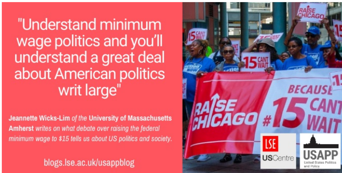
“Fight for 15 Rally Chicago Illinois 8-22-19_2268” by Charles Edward Miller is licensed under CC BY SA 2.0.

Despite this popularity, lobbying efforts of organizations like the National Federation of Independent Businesses , the US Chamber of Commerce , and the National Restaurant Association , all known for opposing minimum wage provisions, appear to have succeeded so far in an “under-the-dome” strategy (i.e., the dome of the US Capitol building). More than three-quarters of these organizations’ contributions go to Republicans. Partisan voting mirrors this partisan funding: 97 percent (228 out of 235) of House Democrats voted in favor of the 2019 Raise the Wage Act of 2019 and 98 percent (192 out of 197) of the Republicans voted against . With the filibuster still in play, the final hurdle for a federal minimum wage hike appears unsurmountable: a super-majority in a US Senate now evenly split between Democrats and Republicans.