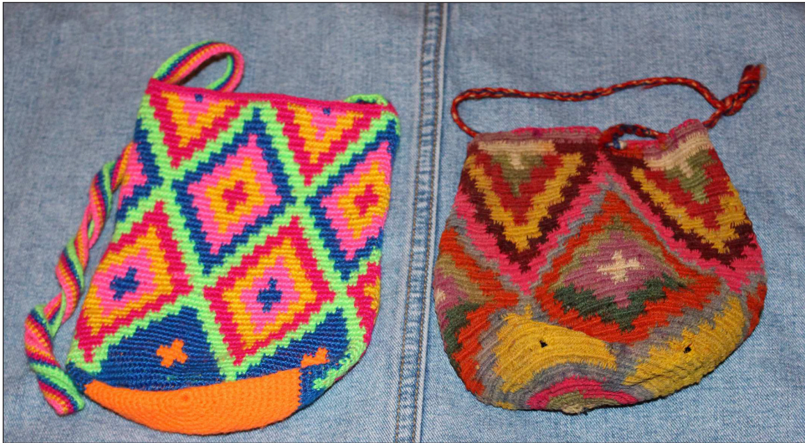
Figure 6: A recent wallki (left) and one from the 1970s (right) of goat hair collected by Sarah Bennison.

In this place, while the workers are in this peace and tranquility, they begin the padrón of the wallkis and of the hand-made gourds [for lime] ... that demonstrate the manual labor of each person ... consist[ing] of a small, well-wrought bag with threads of different colors and little gourds that are also well made ... and like ... the instrument the Chirisuya or oboe, everyone who knows how is obliged to play ... under the pain of being reprimanded and punished. (Entablo f. 5v) 12