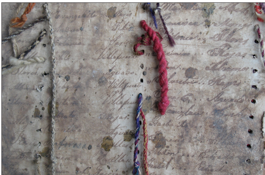
Figure 3: Cords of different thickness and texture, Mangas khipu board. The thinnest threads (e.g., the purple, blue, and white cord) are soft, while the thickest (e.g., the pink cord) are rough.

the padrones were also referred to as entablos in the Peruvian pastoral visitation reports from the Huacho diocese.