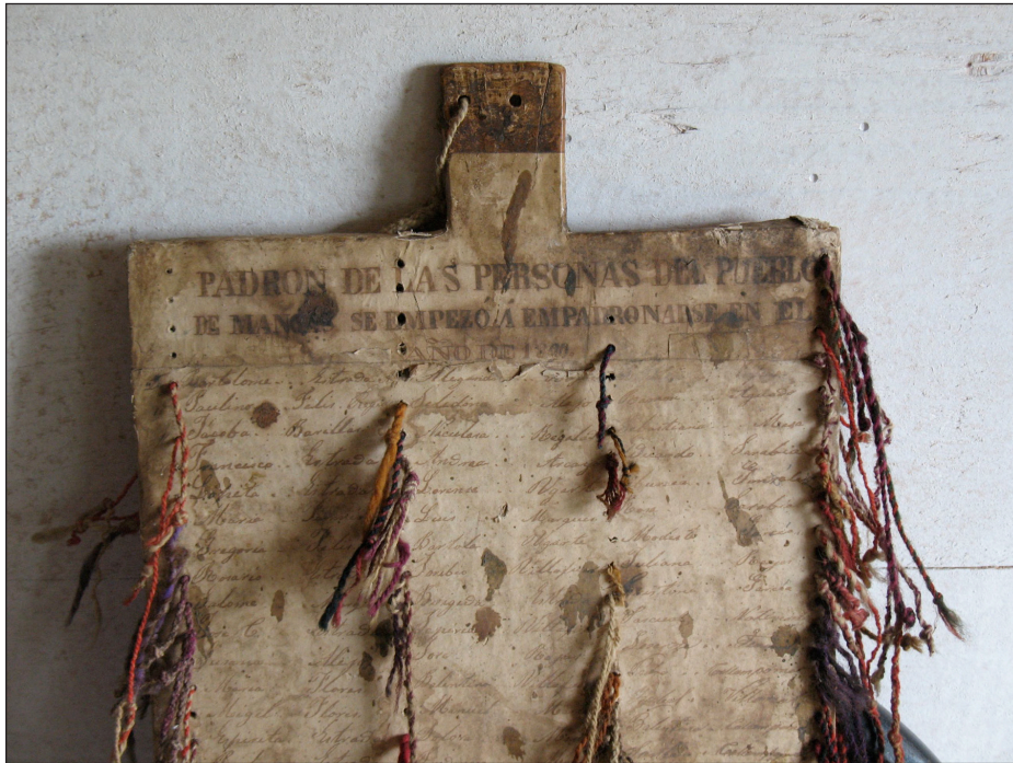
Figure 2: The khipu board of Mangas.