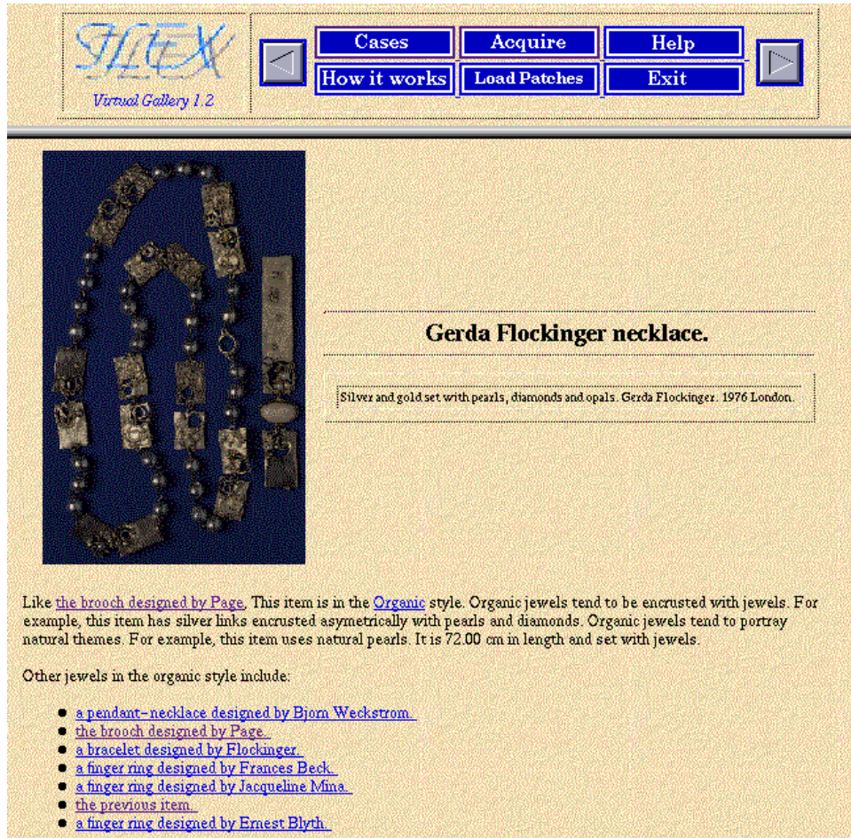
Figure 3: Second visit to the Flockinger necklace (after an excursion to a brooch by Page).