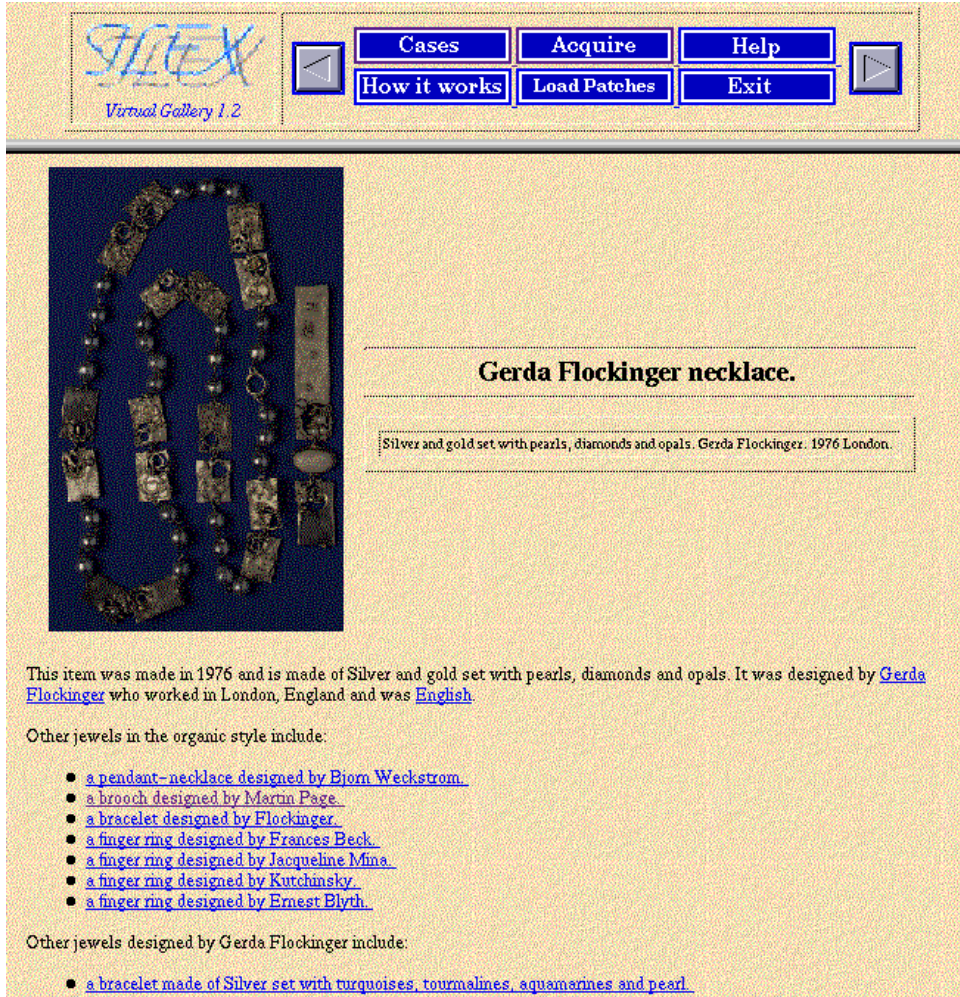
Figure 2: First visit to the Flockinger necklace.