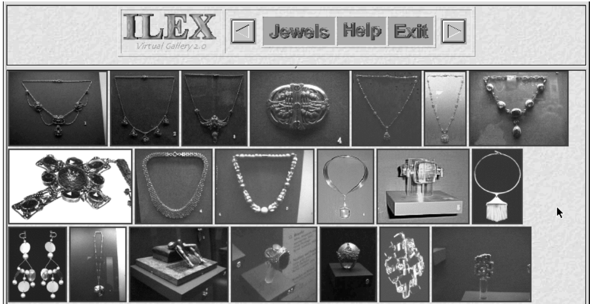
Figure 1: the front page of ILEX2.0