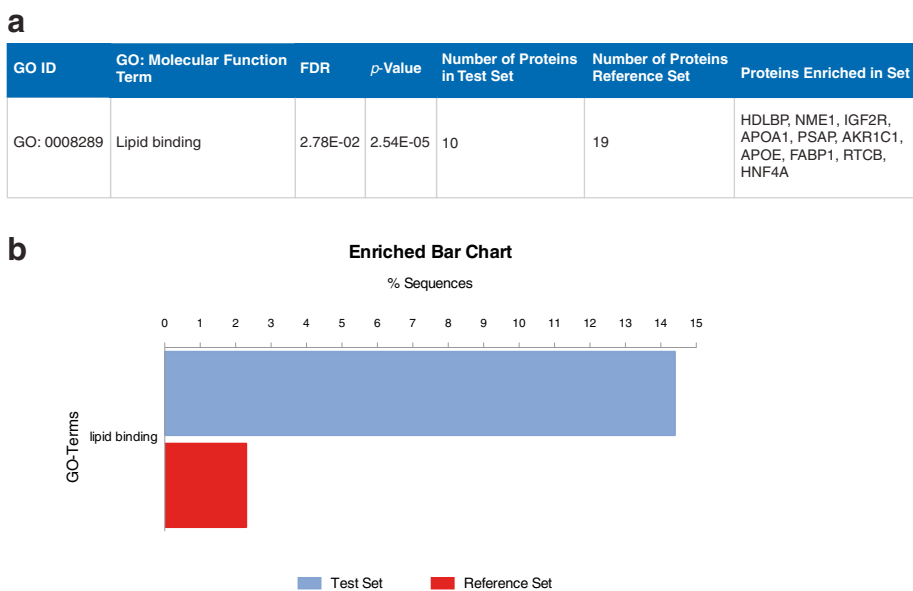
Fig. 1 Enrichment analysis for LPON treated cells using Blast2GO. a Overrepresented GO: Molecular Function terms in LPON treated cells. b Enrichment bar chart of significant GO: Molecular Function term demonstrating the percentage of sequences annotated with LPON compared with the reference set based on the Fishers Exact Test results

acetyl-coA towards mevalonate pathway is evident by a 3.2-fold increase in the expression of squalene synthase, the first committed step to sterol synthesis. Furthermore, the significant rise in the expression of apolipoprotein A1 (APOA1), high density lipoprotein binding protein (HDLBP) and apolipoprotein E (APOE), all of which