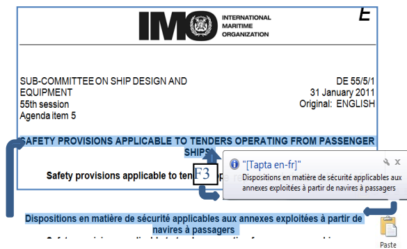
Figure 1: Translating with the “auto hotkey”

A web interface allows users to submit short texts and access the corresponding automatic