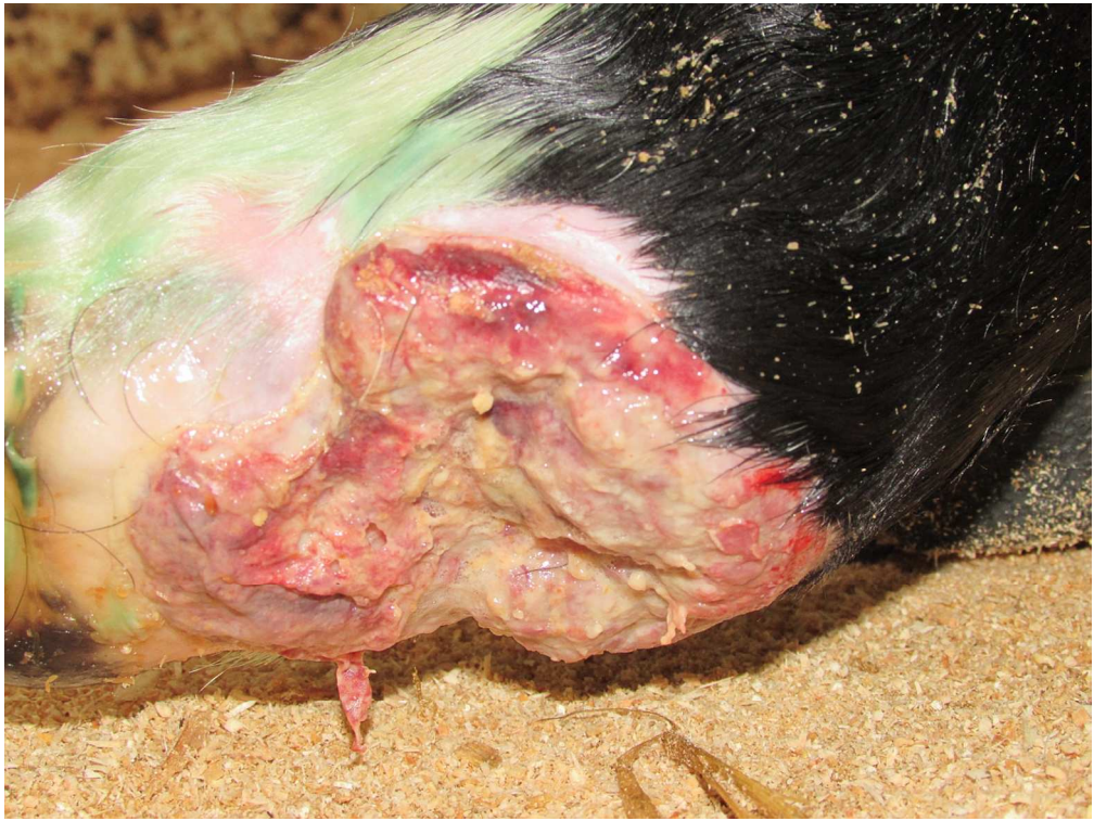
Figure 3: Photograph of digit amputation site 2 weeks following surgery. Poor healing and necrotic granulation tissue is visible. 119x90mm (300 x 300 DPI)

1 2 3 4 5 6 7 8 9 10 11 12 13 14 15 16 17 18 19 20 21 22 23 24 25 26 27 28 29 30 31 32 33 34 35 36 37 38 39 40 41 42 43 44 45 46 47 48 49 50 51 52 53 54 55 56 57 58 59 60