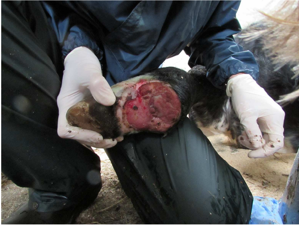
Figure 4: Photograph of digit amputation site 3 weeks following surgery. Healthy granulation tissue after lavage with hydrogen peroxide and 3 days of honey impregnated bandaging. 119x90mm (300 x 300 DPI)

1 2 3 4 5 6 7 8 9 10 11 12 13 14 15 16 17 18 19 20 21 22 23 24 25 26 27 28 29 30 31 32 33 34 35 36 37 38 39 40 41 42 43 44 45 46 47 48 49 50 51 52 53 54 55 56 57 58 59 60