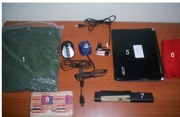
Fig. 2. Computer hardware and logistics: (1) the raincoats; (2) the mouse; (3) the biometric fingerprint devices; (4) the web cameras; (5) the mini-laptops; (6) the red calico used for the background of the photos taken; (7) the spare batteries for the mini-laptops; and (8) the field notebooks used.