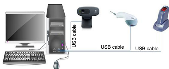
Fig. 3. Setup for the computers, with peripheral devices. This setup is typical of computers at the health facilities. Each of the peripheral devices was connected to the computer system’s unit via a USB cable. The device to the extreme right of the diagram is the fingerprint detector. Next to the fingerprint detector is a barcode reader for scanning identification cards with barcodes. The last device (black) is a web camera.

residence population. In addition, a license key was purchased to activate the fingerprint scanning device of each computer and a server was purchased to store backups. One box of tools and other accessories were procured for the maintenance and repair of the computers.