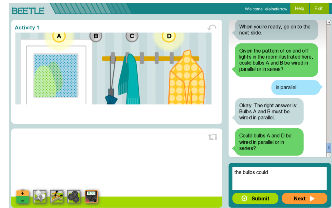
Figure 3: The browser-based user interface uses industry standard technologies: HTML5, CSS3, JavaScript, and the Play Framework, an open source web programming framework.