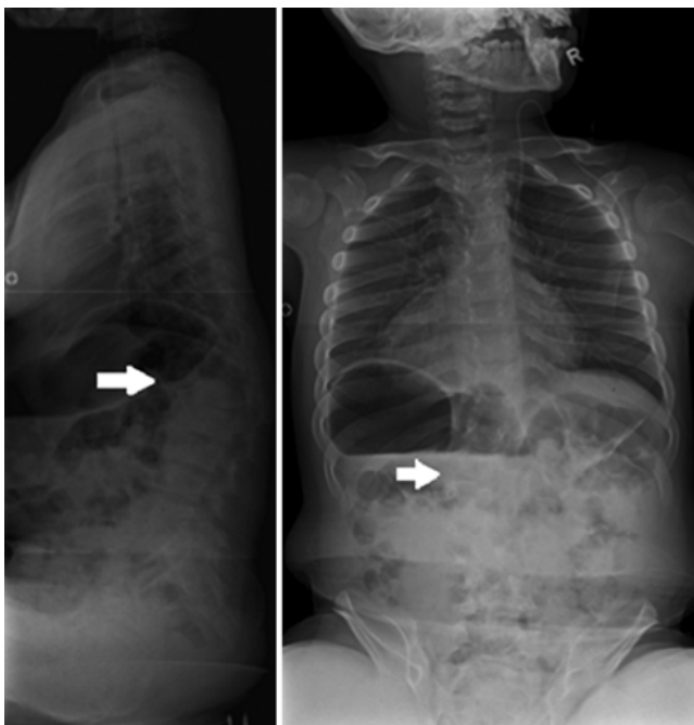
FIG. 1. Preoperative radiographs demonstrating T11–L3 kyphosis of 60^\circ with an anomalous L-1 vertebra (arrow, left) and T11–L3 scoliosis of 42^\circ convex to left (arrow, right).

muscle tone, muscle power, sensation, and deep tendon reflexes in the upper and lower limbs, within the limitations of the underlying behavioral disorder. There were no signs of spinal dysraphism, and the patient had no bowel or bladder dysfunction. Spinal radiographs (obtained in the erect sitting position due to poor patient compliance) demonstrated kyphosis of 48^\circ (from T-11 to L-3) and scoliosis of 22^\circ (from T-11 to L-3) with an anteriorly hypoplastic L-1 vertebra. Surgical stabilization of thoracolumbar kyphosis was scheduled and was performed 6 months after presentation, during which medical comorbidities were optimized and an elective preoperative tracheotomy was established. The thoracolumbar deformity progressed to 60^\circ of kyphosis and 42^\circ of scoliosis prior to surgical stabilization (Fig. 1). Spinal CT scans revealed subluxation of the left T12–L1 joint causing segmental instability, rotatory displacement of the spine proximal to L-1, and bilateral L-5 isthmic spondylolysis with no associated lumbosacral spondylolisthesis (Fig. 2). Spinal MRI revealed disc herniations at the T12–L1 and L1–2 levels that contacted both the conus medullaris and cauda equina (Fig. 3). MRI also demonstrated mild canal stenosis at the craniocervical junction due to periodontoid soft-tissue hyperplasia but no cord compression. During intubation, hyperextension of the cervical spine was avoided.