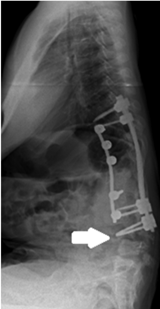
FIG. 5. Whole-spine lateral radiograph obtained 2.5 years postoperatively, when the patient was skeletally mature, showing no loss of kyphoscoliosis correction. Note the development of a Grade II L4–5 spondylolisthesis (arrow).

decision was made with the family to pursue conservative management given that the patient was asymptomatic and ambulating, and previous operations had been associated with significant risks, requiring elective tracheotomy and prolonged ventilator support postoperatively. The spondylolisthesis below the previously surgically treated levels remained stable to the end of skeletal growth. This case report highlights the risk of developing further deformity or segmental instability, producing spondylolisthesis below a previously performed instrumented spinal fusion in patients with connective tissue disorders, such as MPS. Patients with MPS may be at particularly high risk of such