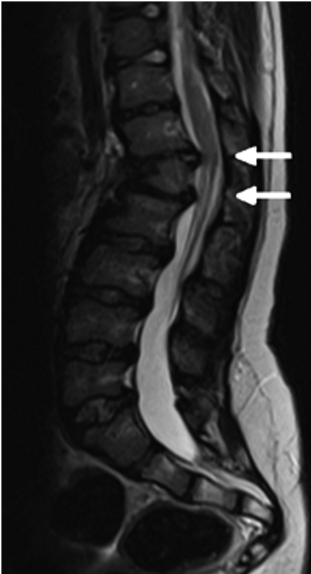
FIG. 3. Midsagittal MR image of the spine showing T12–L1 and L1–2 disc herniations (arrows) contacting the conus medullaris and cauda equina but causing no compression.

spondylolisthesis at the adjacent distal L4–5 level (Fig. 5). In the absence of symptoms or any further progression of spondylolisthesis to 3.5 years of follow-up, a decision was made by the parents against distal extension of the fusion and to continue conservative management. The patient has since developed carpal tunnel syndrome, which remains under review awaiting treatment.