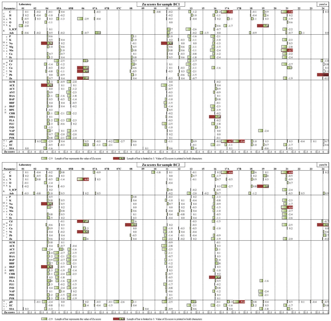
Figure 1. continued

In case a laboratory reported multiple results for a given parameter, the robust mean was used as laboratory value and the robust SD of this mean as a measure of the repeatability of the analysis within this laboratory (repeatability SD). For comparison, a reference value was defined for each parameter, which was based on currently recommended