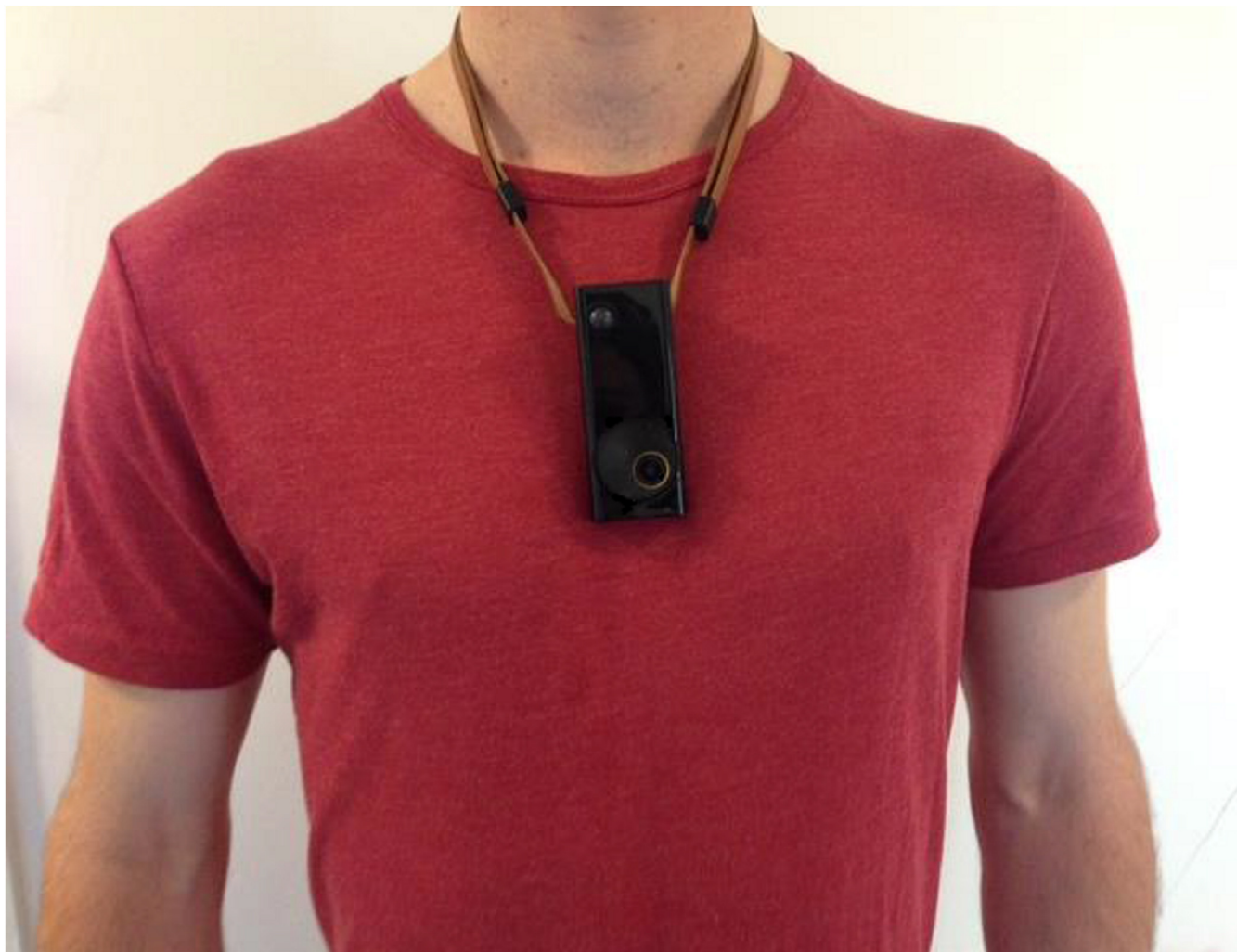
Fig 1. The Autographer wearable camera on adjustable lanyard.