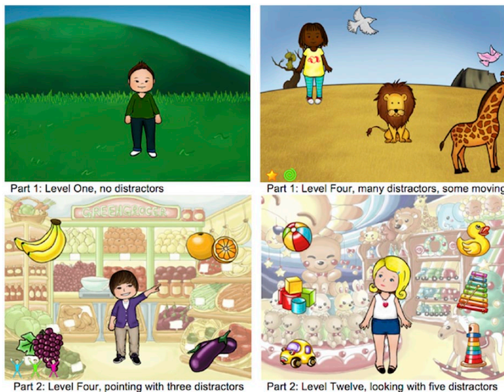
Figure 2. Screenshots from the FindMe app.