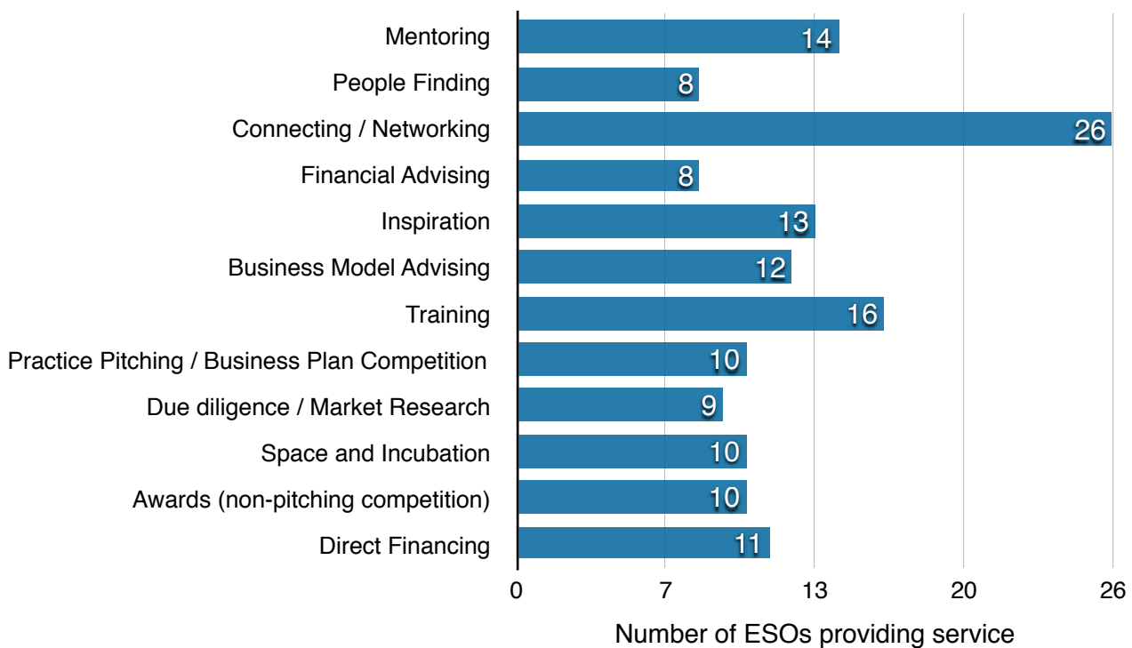
Figure 1: Types of Support provided by ESOs in Edinburgh

ESOs were further classified based on the stages of a venture’s lifecycle they provide support for. Services can be supplied at the idea stage, where the