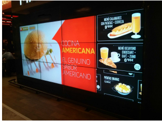
Figure 1: An example of a Blindingly Visible digital display. Recently one the size of an American football pitch was added to Times Square. By making use of the natural human reaction to horrific or traumatic events, future systems are being developed that will aim to implant images you cannot forget, directly into your brain.

data. Stanjano[15] suggests the difference in names was often connected with different research groups and a desire to claim antecedence in the concepts than any concrete differences. Yet the terms do convey different nuances within the field. We can now regard ubiquitous and pervasive as synonymous. Pervasive, while starting with a more systems focus, was the term popularised by IBM and Ark and Selker[2] and like ubiquitous computing, focuses on the notion of computers being in everything and being everywhere. Invisible Computing[11] focuses more on the distinction between a standalone PC and the vision of computers merging into the environment. These fields have been gradually superseded over the past decade with Blindingly Visible Computing (See Figure 1), or as termed in the recent EU H2020 call, In Your Face (IYF) Computing 1 . Sentient Computing[8] and Ambient Intelligence[5] focus more on the how computers can silently predict and attend to our needs and wishes. A contrast to this approach can be found in many deployed systems, such as Airport information systems, which are designed with the contrasting approach of Not Giving a Shit (NGS) Computing where the user needs are ignored and the focus is instead on the service providers needs. Over the previous few decades we have also seen a take-up of the Ambient Ignorance approach to computing which has been shown to be cheaper and more efficient to implement, and in the end, less annoying.