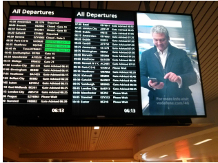
Figure 2: A departure board from a UK airport demonstrating that the airport regards advertising revenue as exactly twenty times more important than giving you flight information.