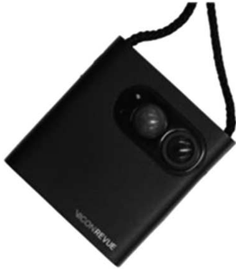
Fig. 1 The Vicon Revue wearable camera

over the next four consecutive school days. Although we were interested only in their journeys to and from school, participants were asked to wear the devices during the school day to accustom them and others to them, in an effort to reduce reactivity. Images collected during the school day were automatically deleted and were not available for analysis. Participants were told that they could remove the camera at any time if they wished or were asked to do so. They received text prompts before commencing their journey to school each morning and after they returned home at the end of the school day to remind them to charge the units and to wear them on their next journey to school.