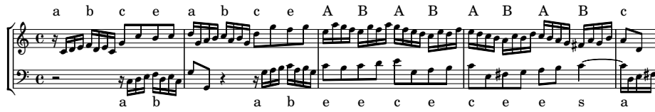
Fig. 1. Patterns used to model musical surface of Bach invention #01 in C major, taken from the first four measures of the soprano voice. All patterns have a duration of a quarter. The main patterns are a/A : four sixteenths in a upwards ( a ) or downwards ( A ) movement; b/B : four sixteenths (two successive thirds) in a upwards ( b ) or downwards ( B ) movement; c : two eighths, large intervals; e : two eighths, small intervals.

abce|abce|ABAB|ABAB|c?AB|BBzz||--ab|--ab|--AB|--AB|eece|cees|... --ab|--ab|eece|cees|abce|ec?z||abce|abce|ABec|ABec|ABAB|ABAB|... ... |abAA|BbAz||ABss|abss|ABss|abss|abab|abcz|AB??|----|| ... |c?AB|BBcz||--AB|ssab|ssAB|ssab|eece|ceAB|ceaz|----||