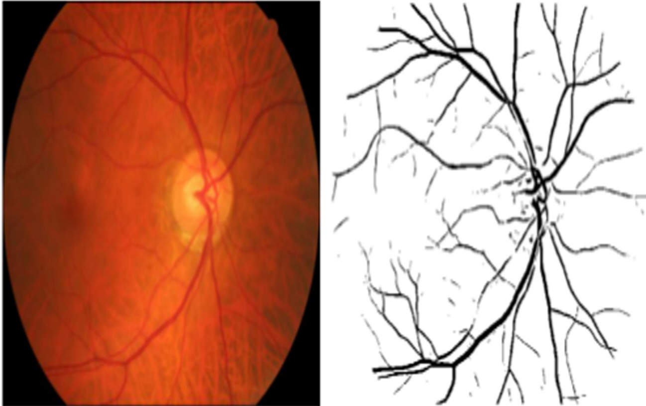
Fig 2. Colour retinal image acquired by fundus photography and retinal blood vessels segmented by computerized procedure.