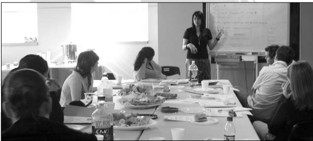
The council busy at work

"Having the opportunity to meet fellow council members to exchange ideas, views, theories and resources is an invaluable asset, not only to the peak body and our respective communities but also allowed a great deal of professional and personal growth for myself. Allowing me to network with like minded individuals and bounce ideas and opinions etc!!!!"