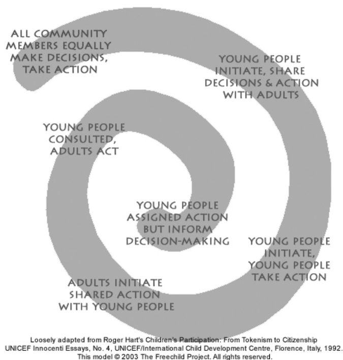
Figure 1. Measure of young people and social change.

The Freechild Project (2003) conceptualises participation thus: