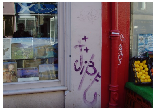
Crime rates in Scotland peaked in 1992 and 2004.

This study aimed to address this gap by exploring the crime drop in Scotland in two main ways. First, we aimed to examine trends in four specific types of crime, rather than crime at the aggregate level, to produce a more nuanced picture of change over time. Second, by developing complex models of crime, we aimed to examine potential drivers of change in these four types of crime by exploring their relationship with a range of factors known to be associated with crime.