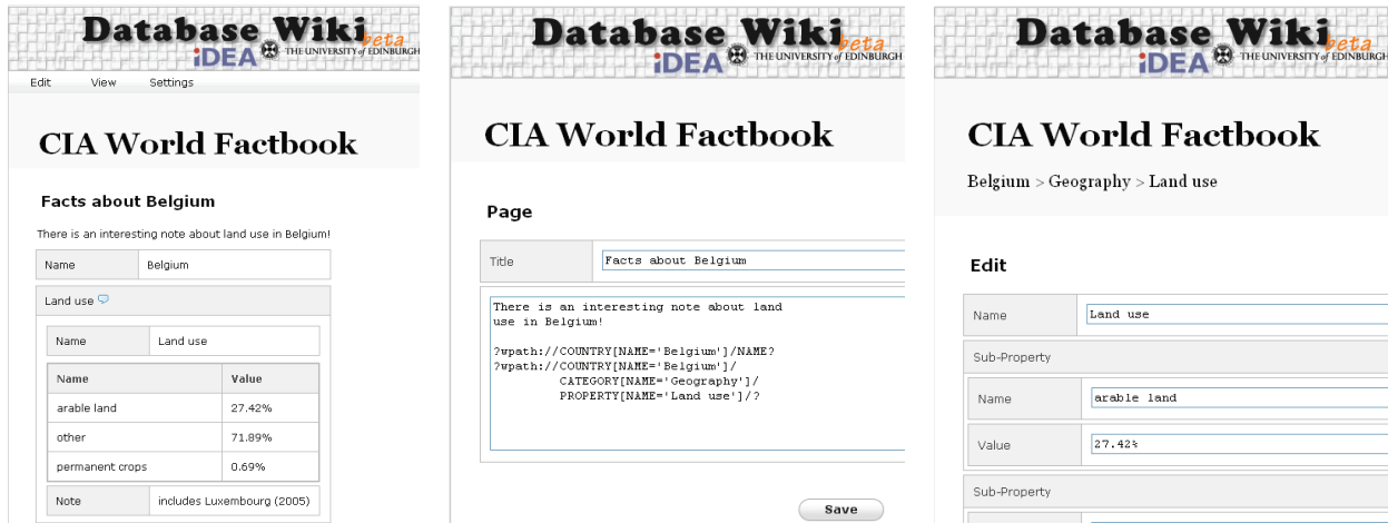
Figure 4: Wiki pages (from left to right) embedded query result, page source, and data update form.