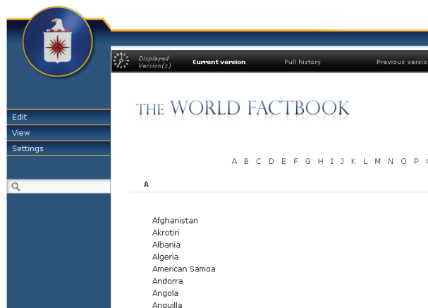
Figure 3: CIA World Factbook web interface in DBWIKI with time machine and edit menu

Users interact with DBWIKI through a web browser, making requests encoded using URLs for either brows-