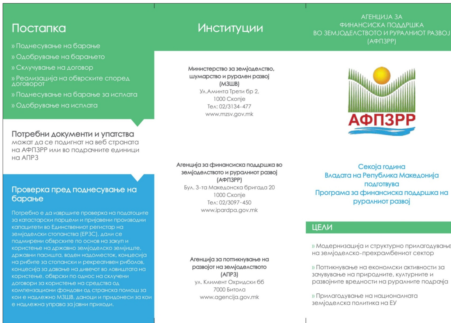
Figure B: The original information brochure