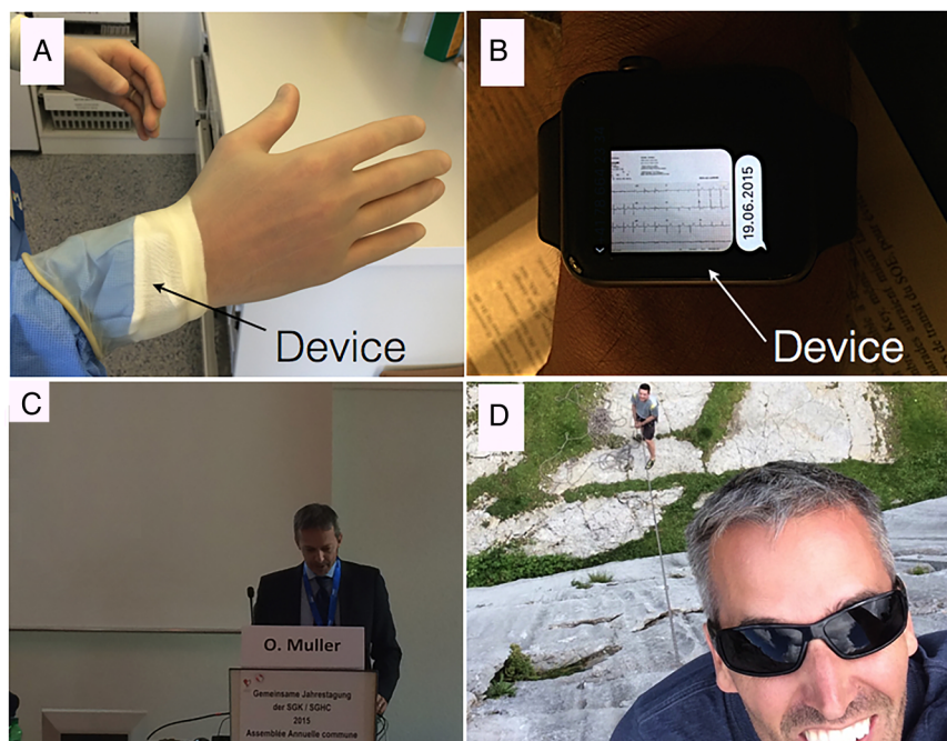
Figure 1 Examples of recordings in an Interventional Cardiologist’s Activities in Daily Life (ICADLs). (A) Cardiac interventions: the footprint of the device (arrow) is visible in the sterile shirt (a sterile glove covering it). (B–D) The device is worn on the wrist during ‘on-call’ and other activities (here, giving lectures or rock climbing).

The device showed minimal physical activity during cardiac procedures, so any increase in HR must have been triggered by mental stress. It appears that the HR increase is inversely proportional to age: operators <45 years had a fivefold to eightfold greater HR increase compared with those >60 years. One possible hypothesis is therefore that mental stress decreases with age and/or experience.