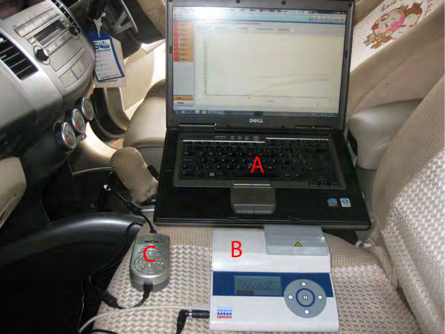
FIGURE S2: Picture depicting the equipment used to run the recombinase polymerase amplification powered by a car battery. A-computer, B-ESEQuant Tube Scanner (Qiagen, Germany), C-adaptor to connect the tube scanner and the computer to the cigarette lighter receptacle in the car.